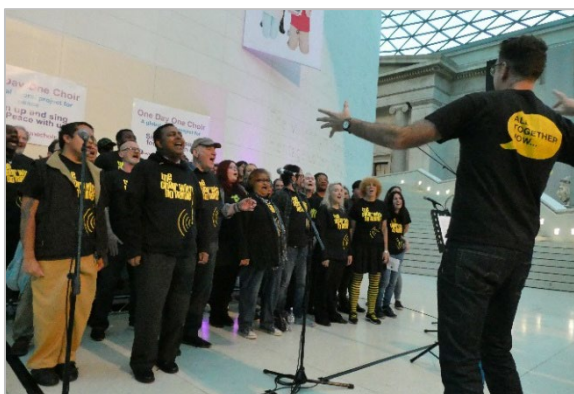
The choir with no name