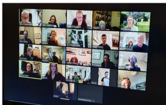
Crystal Palace Progress Band meet online