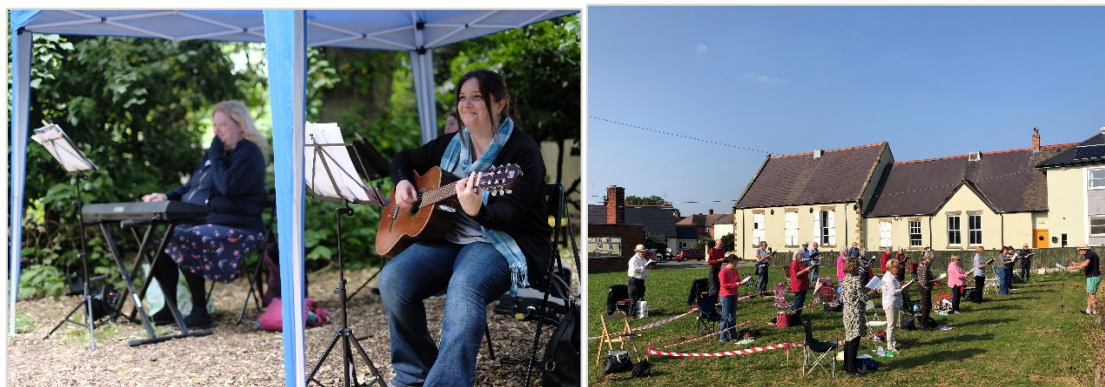
Member groups Misfits Music and Cantiones Choir rehearse outdoors in summer 2020

Our Board and staff have proven to be flexible, moving rapidly at all the stages of the pandemic to adapt their working practices and still provide first class support to members. Making Music will continue to focus on supporting its team, practically as well as in terms of mental wellbeing, as a priority, recognising the challenges the last year has created for many of them, personally and at work.