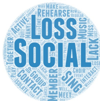
Making Music March 2020 survey: what does suspending your regular activity mean for your members and group?

When and where leisure-time music activity was permitted, we supported members with risk assessment guidance and templates to enable them to meet, to counteract the decline in mental well-being by their participants, the loss of income to the music professionals usually engaged by them, and groups' fear of losing their musical abilities as well as participants.