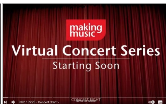
Making Music Virtual Concert Series on YouTube