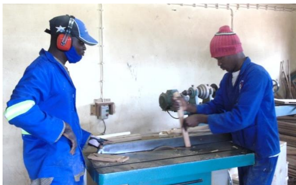
The Social Movement of St Gabriel aims to teach and provide formative elements to a group of 80 children between 6 and 21 years of age.

We gave another £7,800 to the friars working in Zululand South Africa.