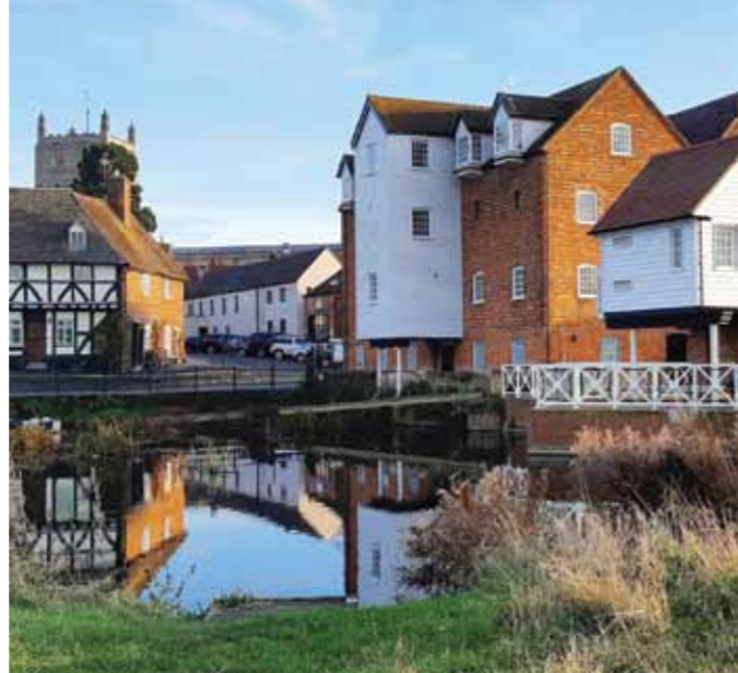
Tewkesbury Borough Council

In August 2020, the Government published proposed changes to the way they calculate the minimum housing requirement for each local authority area in the country. This revised method proposed increasing the requirement for Stroud District from the level set out in the 2019 Draft Local Plan of 638 homes per annum, to 786 homes per annum.