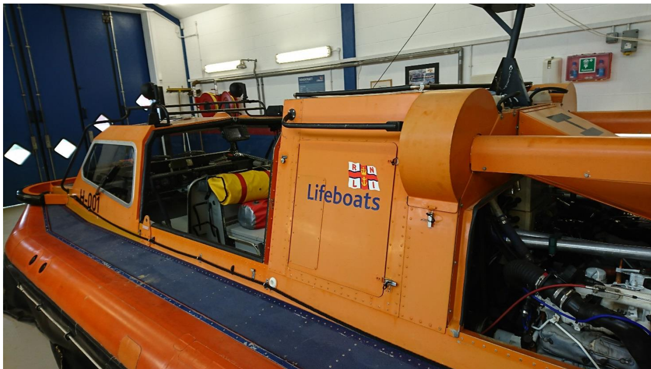
H-001 Standing in for Hunstanton Flyer (Civil Service 45) at RNLI Hunstanton

The Lifeboat Fund is a fundraising charity which exists solely to support the Royal National Lifeboat Institution's work to save lives at sea. The Fund was established in 1866 and, since then, has provided the RNLI with 52 boats (funded 53) and significant extra assistance.