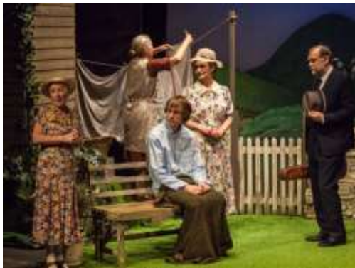
"Ladies in Lavender"

In March Government Regulations meant the Theatre was to close and it was not possible to open again until after the end of the year which this report covers. However, whilst the pandemic resulted in the Abbey Theatre and the CoT having to face tremendous challenges, just as other parts of the UK's entertainment industry, it was also the year that we really showed our mettle by drawing together and providing support for our members and the community we serve. We tailored our programme to meet the constraints of Covid; and we demonstrated flexibility and ingenuity with our online Corona Monologues competition, 'Zoomed' play readings and other activities.