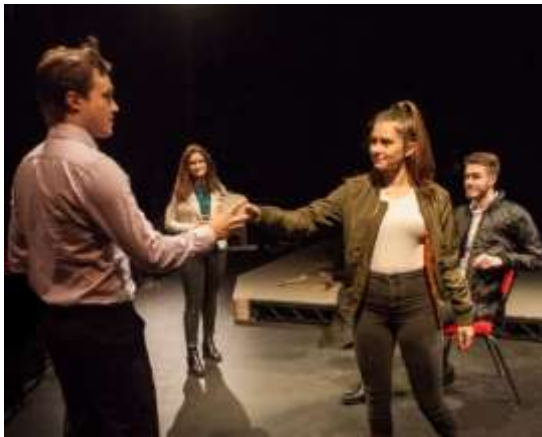
"Dealing with Clair"