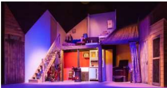
"George's Marvellous Medicine"