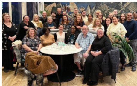
ACT Thanksgiving meal