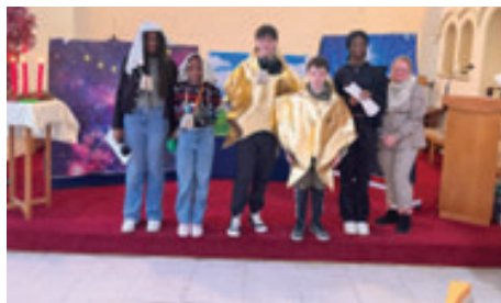
Young people leading nativity

We run two well-attended Friday Night drop-in sessions with good numbers in both. Throughout the year we have seen a higher proportion of attendance in our younger group. A decision has been made to split the timings, with more space given to our younger group. It is such a blessing to have an increasing number of young leaders, and we enjoyed a thanksgiving evening at Cosmos together.