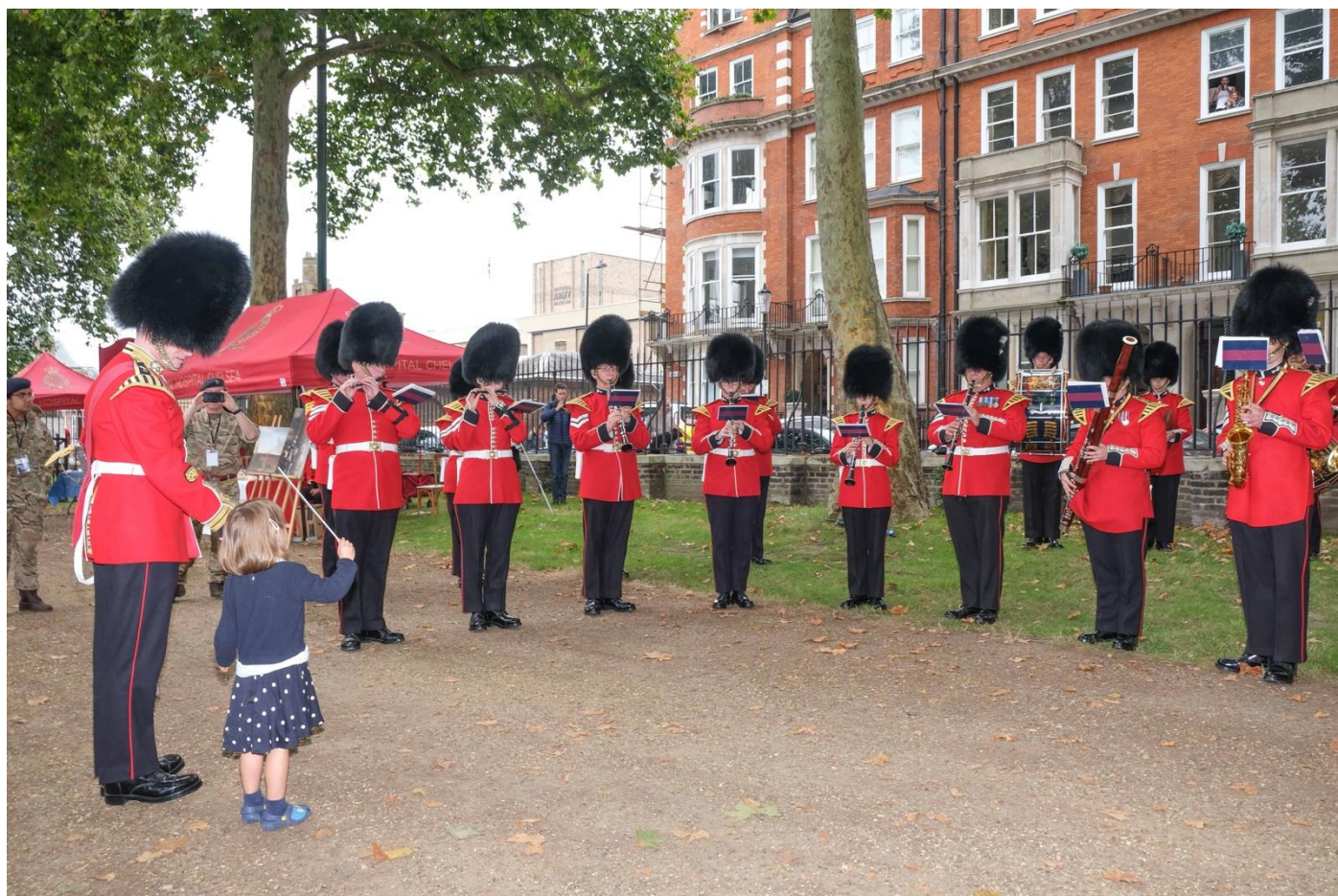
The band of the Welsh Guards performing at History Village.

In addition, the Museum participated in the third Chelsea History Festival in partnership with the Royal Hospital Chelsea and the Chelsea Physic Garden. As with the Museum's public programme there were some hybrid elements with a combination of in-person and some digital events taking place. A total of 70 events took place with an in-person attendance of 5,444 across the festival period. As in the previous year the programme consisted of a series of talks, musical performances and family friendly activities and sought to act as a place to pause and reflect on our past. New to the festival this year was the introduction of history village, an interactive event held on Burtons Court which allowed visitors to step back in time and bring history to life with living historians, serving military units and local cultural organisations.