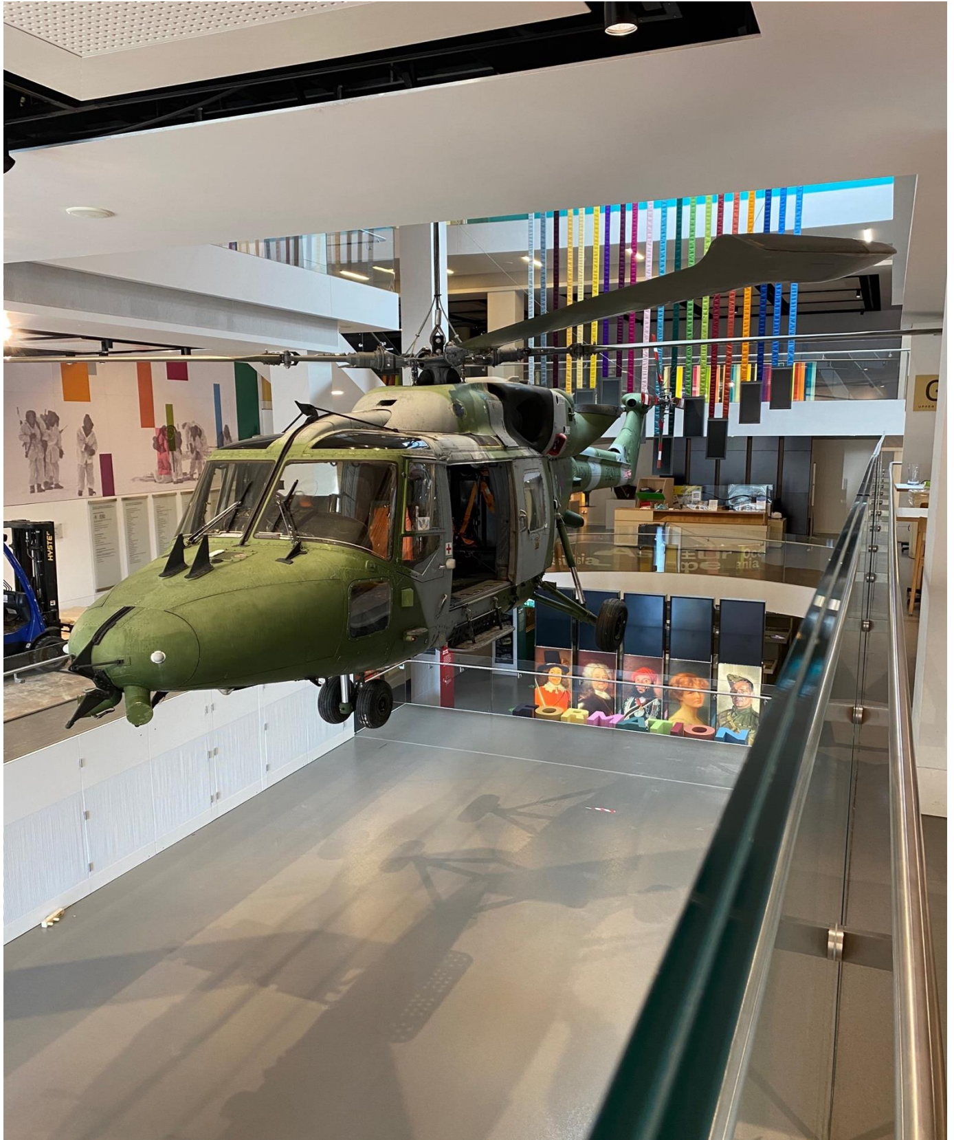
Lynx Mark 9a Helicopter suspended in the Atrium