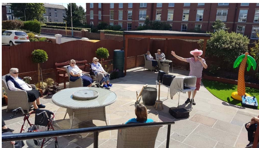
As you can see we still managed to have some fun!

Sister M's first year has been very different to how we all expected it to be, but we have made the best of the situation and with dedication and teamwork, have worked through it very well.