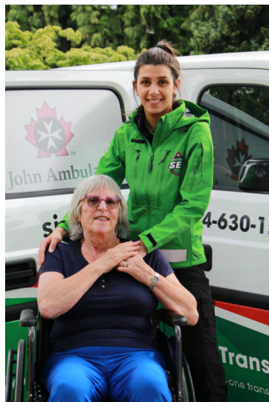
St. John Ambulance Canada

The following stories illustrate our impact through the words and experience of St John people in 2022. Each story additionally highlights one of our eight values.