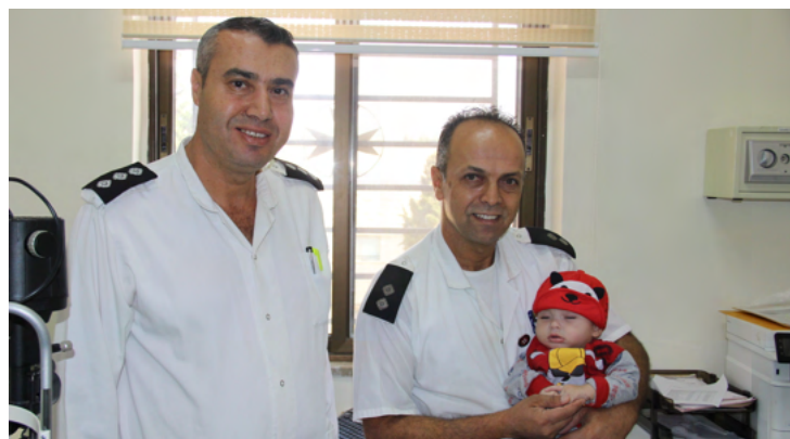
St John Eye Hospital, Jerusalem