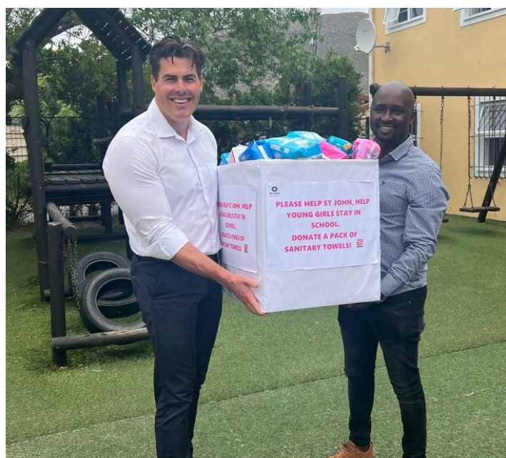
St John South Africa

To provide the best leadership for St John in the future, the International Office is coordinating a leadership development programme. The programme will identify future leaders from across the St John family of organisations to support the pipeline of talent for senior leadership positions in the future, with the dual aims of bringing more diversity to our leadership and developing a cadre of leaders with the capacity and experience to take the Order to the next stage of its development.