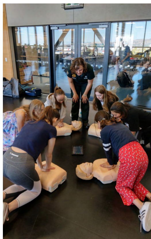
St. John Ambulance Canada