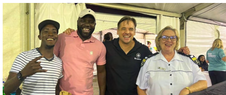
St John South Africa

By working within a regional group, St John Establishments should feel more clearly that they are part of a global organisation and see tangible benefits from their involvement. Within the three groups - Europe, Africa and the Middle East; the Americas; and Asia Pacific - and through the sharing of best practice and the provision of expert advice based on successful operations, the larger Establishments will provide vital support to smaller ones wishing to grow and develop, and in the longer term may also see opportunities to set up new St John operations.