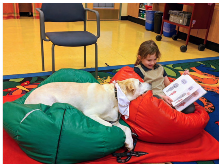
St. John Ambulance Canada