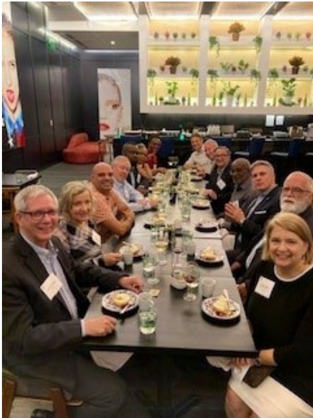
Americas Regional Meeting