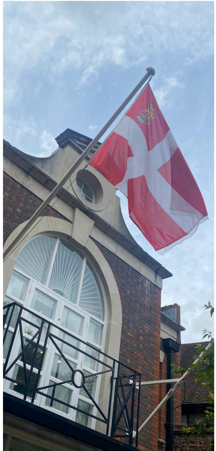
The Banner of the Order of St John flies over St John House, London