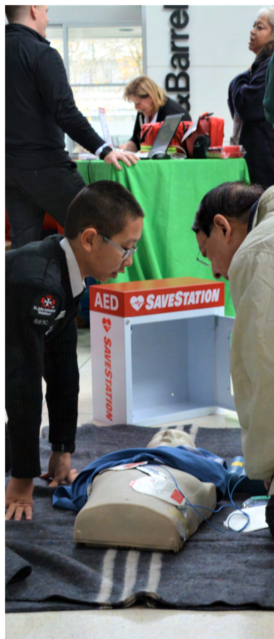
St. John Ambulance Canada

For the Faith and For the Service of Humanity