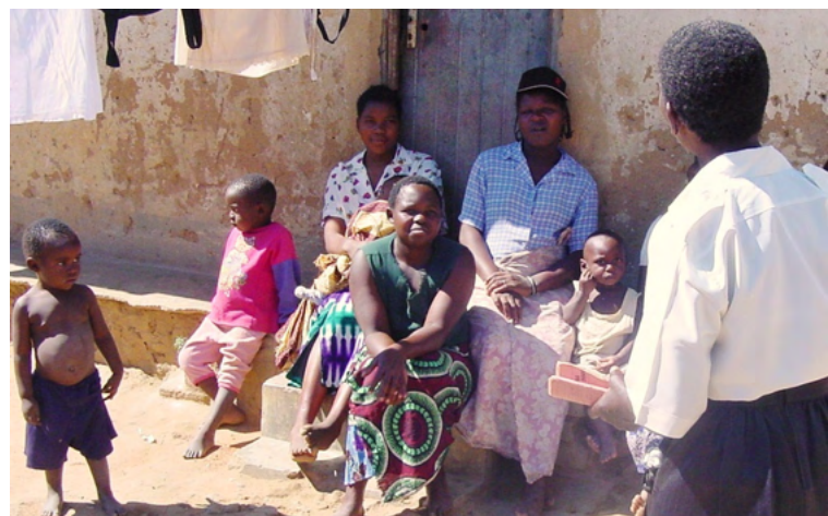
Mother and Baby Programme, St John International