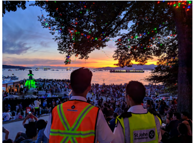
St. John Canada

Volunteers are the heart of St John. With over 200,000 volunteers worldwide, we are deeply rooted in local communities and reflect their population. Many of our volunteers spend decades with us - including our Lord Prior who joined St John as a cadet in 1974 at Glebe Cadet Division, Sydney, and our Grand Prior HRH the Duke of Gloucester who recently received an award for fifty years' service to the Order. The devotion of our volunteers is the foundation on which we build all our work. Volunteers from opposite sides of the world with experience at both ends of the age spectrum illustrate why we value them, and how devotion to our mission plays out in the contribution of thousands of people every day.