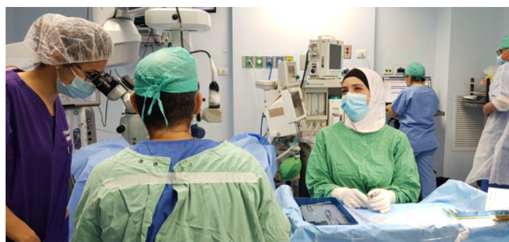
St John Eye Hospital, Jerusalem

Affected babies are then given sight-saving surgery. The Eye Hospital has also acquired an Optic Coherence Tomography machine thanks to US support: over a thousand patients at risk of blindness due to diabetes, corneal problems, glaucoma and hereditary diseases were screened between September and December 2022 using this cutting-edge technology.