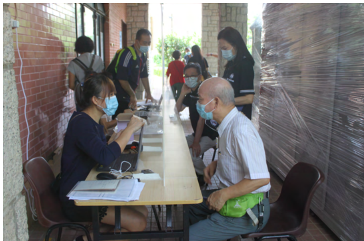
St John Hong Kong

First Aid has always been at the heart of our activity in Hong Kong, and we have worked hard to ensure that we are able to continue to deliver the high-quality professional training which has defined St John Ambulance Hong Kong for nearly 150 years. With continuing restrictions in place in 2022, we pivoted to a blended learning model. Online theory and face to face practical sessions were delivered in Cantonese to nearly 11,000 students in 2022 equipping them to provide lifesaving First Aid. We will be offering the same course in English and Putonghua in 2023.