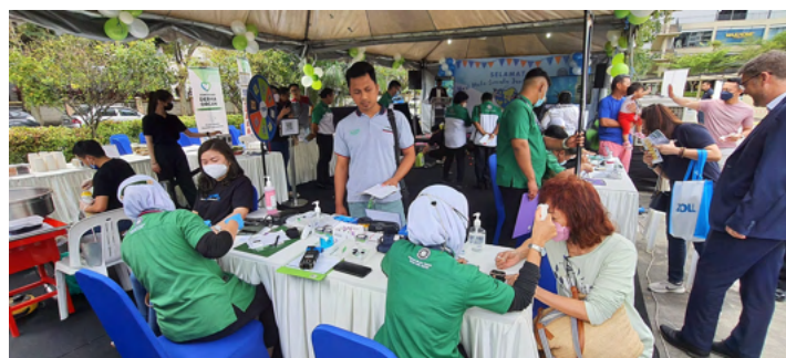
St John Ambulance Malaysia

Because of human dynamics, our volunteers can change due to change of workplace, marriage, migration, studies etc. However, with God's grace, we are still blessed with a sizeable community to carry out our mission. We have 1 WhatsApp doctors' group with at least 10 doctors responding to the call of help; whilst not all are available all the time, we have at least 1-2 doctors who are 'readily available' for any mission. At present we have at least 2 regular nurses and 1 regular pharmacist in our team. We look forward to increasing our pool of volunteers so larger missions can be carried out. As for the auxiliary duties we have at least 15 members to help, but the numbers may change depending on the scale of the mission.