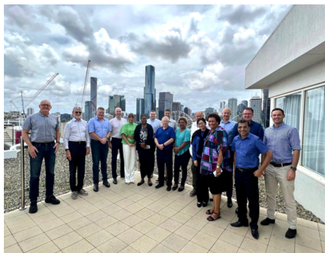
Asia-Pacific Regional Meeting

In my own region - Asia-Pacific - Pories and Associations have come together to consolidate regional knowledge on fundraising, with plans to extend collaboration and provide support to improve and extend operational delivery of first aid, ambulance services and community healthcare through training, educational programmes, technical support and effective governance.