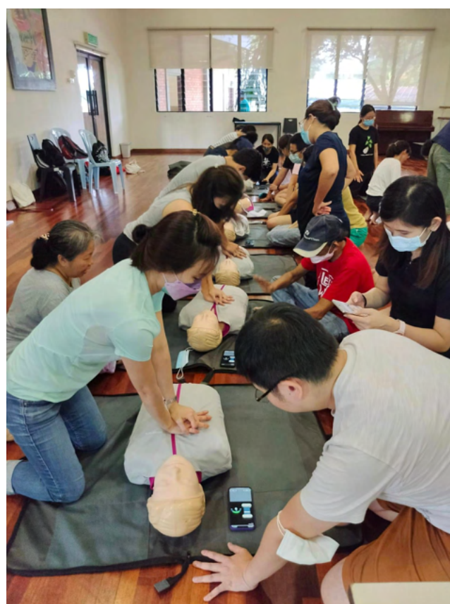
St John Ambulance Malaysia