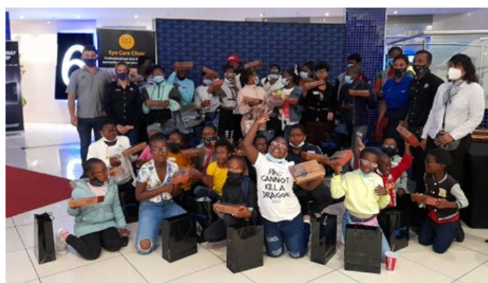
St John South Africa