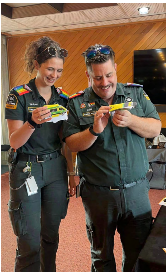
Hato Hone St John

His Majesty King Charles III acceded to throne and became Sovereign Head of our Order. All St John people look forward to the leadership of our new Sovereign Head, and continuing the long and distinguished history of the Order of St John as a Crown Order of Chivalry, giving service to the most needy members of communities everywhere we work.