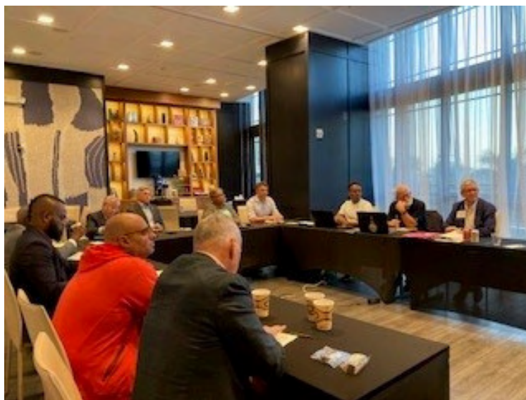
Americas Regional Meeting

Each region is implementing the strategy in ways appropriate to its local context. In the Americas, the Pories of Canada and the USA are supporting Associations in the Caribbean using their own strengths. From the US, we offer assistance with operational management including governance, finance and investment, while our colleagues in Canada are sharing expertise in healthcare and training. We have completed a baseline assessment of every Association and will now work with them to develop professional business plans to drive growth and improve quality across all nine St John Caribbean Associations. Working together, we will reach more people with high-quality services, help our Organisations to become self-sustaining, and reinforce the sense that we are all part of a global organisation, united in our mission and values.