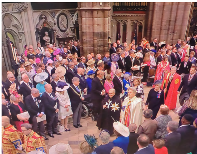
Our Lord Prior in King Charles III's Coronation Procession