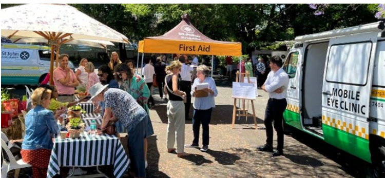
St John South Africa

The next steps will focus on developing, in collaboration with colleagues around the world, a global set of standards covering the whole range of St John activities. These standards will enable the trustees to assess the performance of every Establishment, and to provide targeted assistance to help Establishments develop sustainable operations using the social enterprise model to fund their charitable activities, and to continue our life-saving work around the world. The division of the St John family into three regional groups underpins the Order's global strategy.