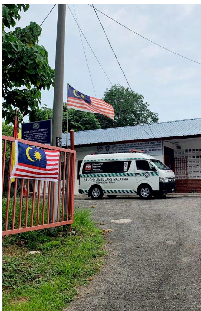
St John Ambulance Malaysia

We believe this mission can be shared and implemented to all St John divisions worldwide especially in countries with poor healthcare where the accessibility is a perpetual problem.