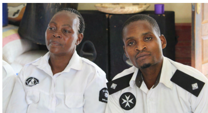
St John Malaysia