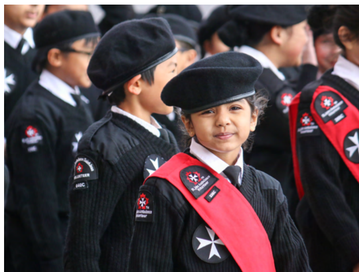
St. John Ambulance Canada

We work for and with communities, building resilience as we go. We adapt our offer to meet today's needs with professionalism and excellence while remaining true to the values and ethos which link us to our origins in the Holy Land nearly a thousand years ago. The Order and its manifestations such as "St John Ambulance" are well recognised and highly trusted worldwide, and we work actively to protect them.