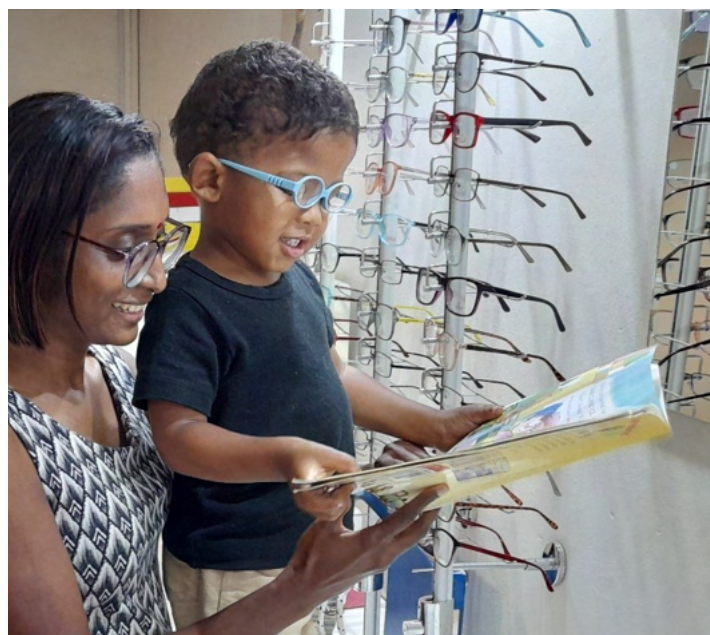
St John South Africa

Our Eye Care team at St John, like our country, is a melting pot of races, cultures, religions, and creeds. This diversity is a great strength of St John as it allows for relatedness and relationship building across all lines.