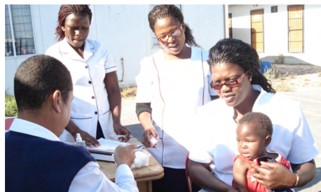
Mother and Baby Programme, St John International