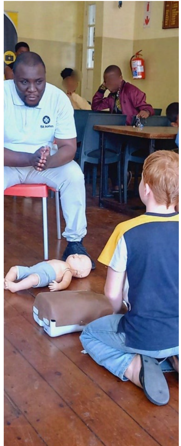
St John South Africa