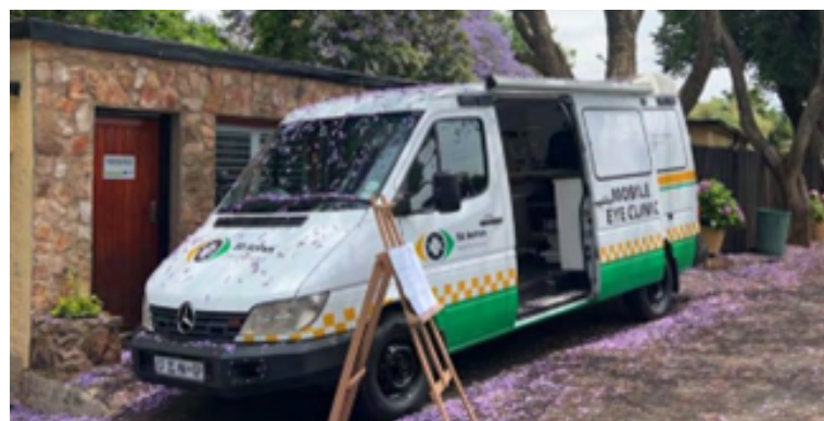
St John South Africa

St John Eye Care serves the community by operating 10 Optometry clinics across South Africa and has been providing eye care services to the public for over 70 years. We have a presence in 6 provinces across the country. We are also very proud of our longstanding relationship and eye clinic at the Chris Hani Baragwanath Hospital which is the largest hospital in the Southern Hemisphere.