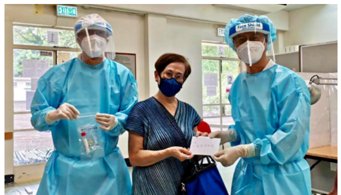
St John Hong Kong

When the fifth wave of COVID hit Hong Kong in February 2022, there was an alarming rise in deaths of elderly unvaccinated people in residential care homes. St John rapidly mobilised over 250 trained volunteers including doctors, nurses, dentists and first aid trainers to set up vaccination teams. In visits to 49 care homes over the following six months, the teams administered 5,145 vaccine doses, making a huge contribution in suppressing the spread of COVID amongst the most vulnerable.