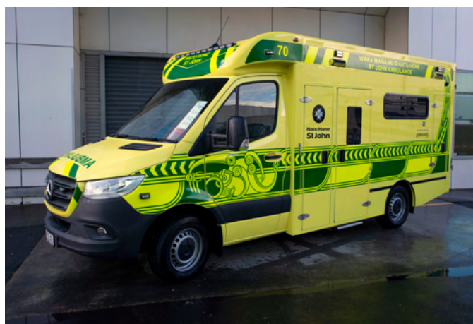
Hato Hone St John

We keep the broader organisation updated on our progress and provide opportunities to celebrate and foster a sense of belonging.