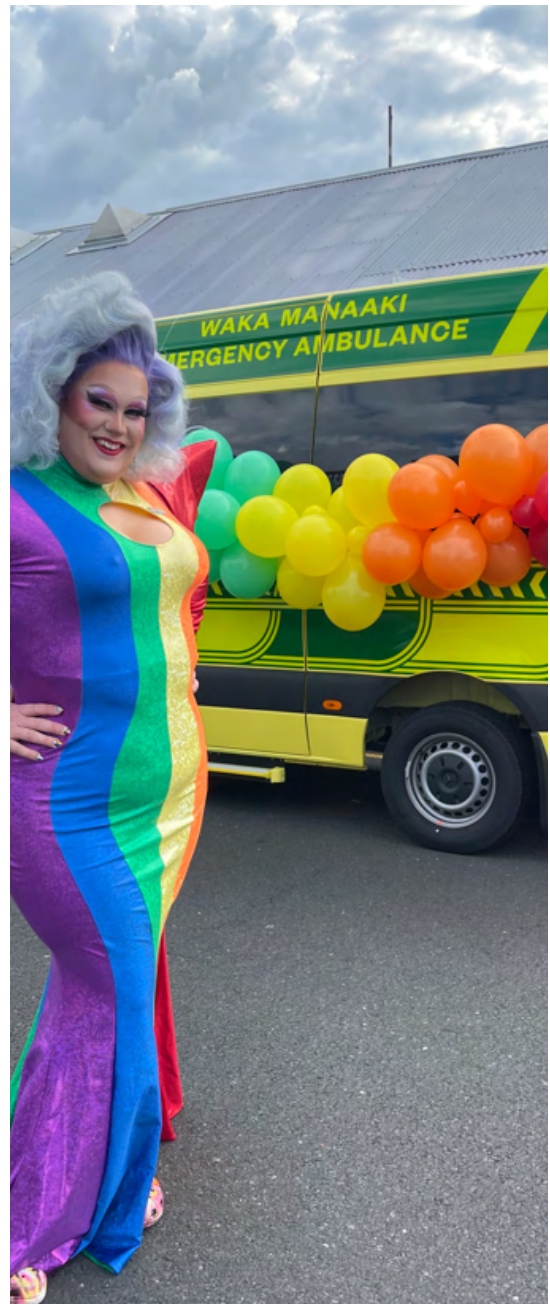
Hato Hone St John

Communication from the Office to all establishments has increased, highlighting success and reinforcing the 'one St John' message at the heart of the global strategy. Co-operation and collaboration are at the heart of the International Office's approach to working with Pories and Associations. The global strategy sets ambitious aims for the worldwide St John family, and the Office's work this year has helped advance progress towards these goals. A new funding arrangement provides a sustainable footing for the Office, allowing us better to plan future activity.