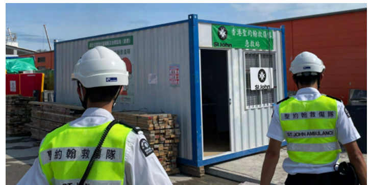
St John Hong Kong