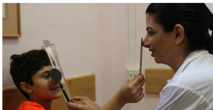
St John Eye Hospital, Jerusalem