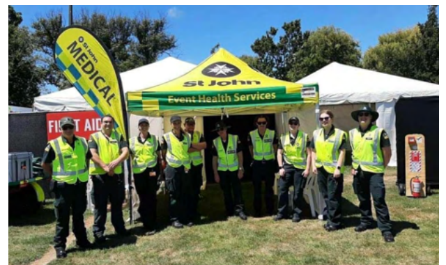
Hato Hone St John