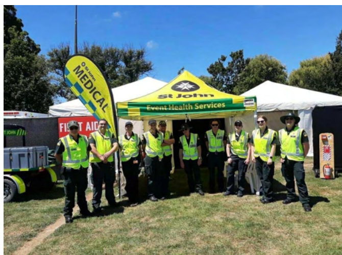
Hato Hone St John