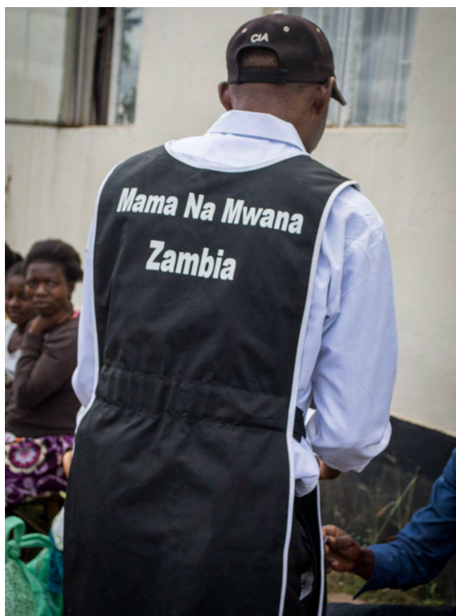
Mother and Baby Programme, St John Zambia