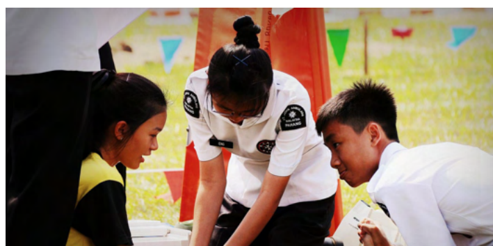
St John Malaysia