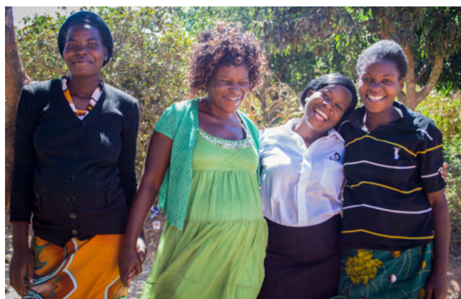
Mother and Baby Programme, St John International

When St John International and the four programme implementing countries came together in November 2022 for a five-day workshop, they reviewed and refreshed the programme's operational Success Model manual. Frank and open exchanges about what did and didn't work allowed us to draw lessons for the future of the programme and develop better tools to improve its impact.