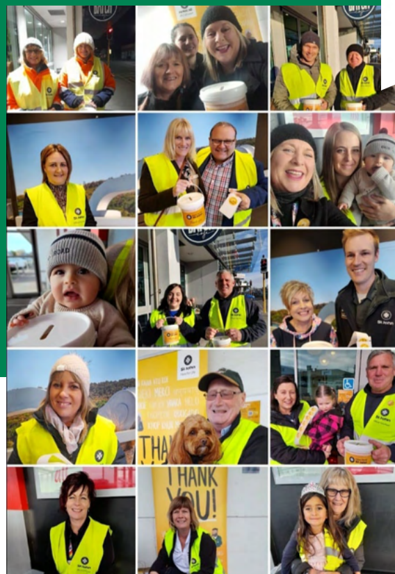
Hato Hone St John

Underpinning our global strategy, which we began work on in 2020 is a new regional approach putting the expertise of our largest and most experienced establishments, the Pories, at the service of the smaller Associations as they grow in scope and expertise to deliver more valuable help to more people in the forty-four countries and territories where we are present.