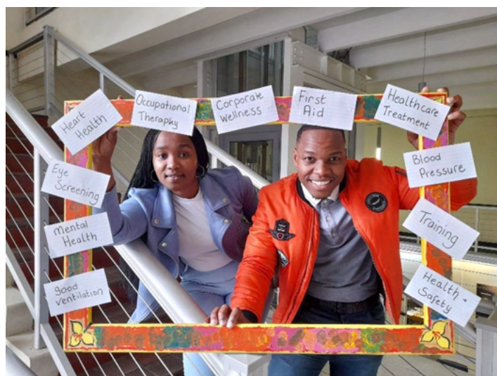
St John South Africa