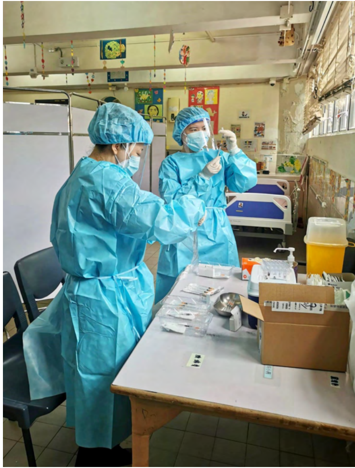
St John Hong Kong

Between February and June 2022, we also contributed to keeping construction workers safe as they built six mobile cabin hospitals at Hong Kong's quarantine facilities. Our 840 trained officers and members provided first aid services to ensure that workers had a safe and secure working environment, responding to a new and urgent need.