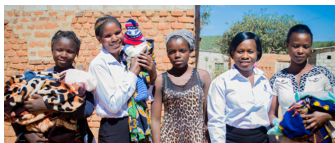
Mother and Baby Programme, St John International

We have gathered evidence to show that the programme has made a positive change to the behaviour of women and men in the community, resulting in healthier maternal behaviour and better care of infants. We reached over 23,200 pregnant women, new mothers, and expectant and new fathers in 2022 – 120% of our target. This engagement has promoted healthier behaviour across 7 World Health Organisation identified maternal health indicators.