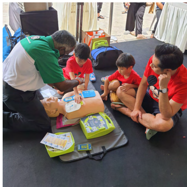
St John Ambulance Malaysia

The provision of healthcare follows an eternal equation between accessibility of the people and accessibility of medical service. So, in ANY situation arising problems from either on the part of the people (income, legal documents, distance, mobility, etc.) or on the part of the medical service (cost, distance, clinic time versus working hours) there will be inaccessibility of healthcare. Refugees are one example where they are not only disadvantaged in terms of income, but they are also required under Malaysian law to pay a registration fee that is more than 10 times to that of a local. They are also devoid of legal documents, which risks them being deported back to their country of origin. By providing a free mobile clinic, we have effectively cut down the problem of cost, distance (we go to them), and timing (our timing is off working hours). From our experience it is often not the availability of healthcare, which is the problem, rather the accessibility of it.