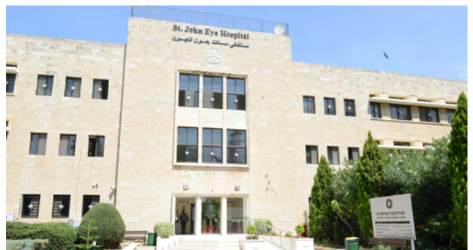
St John Eye Hospital, Jerusalem

We believe that excellence in service means making our care available to everyone, so we need to go the extra mile to reach some people. As the only Eye Hospital in the Holy Land, we offer care to people across the region regardless of their age, sex, colour, religion or ability to pay. We provide not only hospitals but also eye care centres, mobile outreach clinics and screening programmes. We treat routine and emergency cases and if we did not treat our patients, they would often receive no treatment at all for conditions which can have a severe impact on their livelihoods and well-being. I am proud of our commitment to serve the most marginalised areas and poor villages of Palestine without compromising on the quality of our medical attention. Providing that care not only changes lives but also strengthens communities, building their resilience. We carried out 6,900 sight-changing operations in 2022 and treated more than 142,000 patients from Gaza to Hebron.