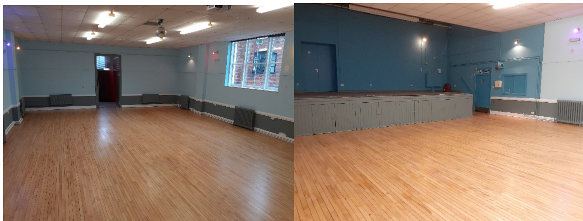
The Newly Refurbished Hall

The Market Hall was reopened in March as a hub for the coronavirus testing in Saxmundham. This was a welcome boost to funds at a time when other indoor activities were severely restricted. A locally accessible testing centre was helpful to businesses in the Town before lateral flow testing was widely available.