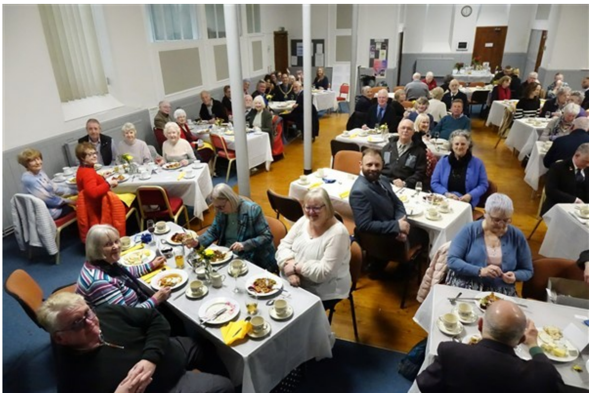
Members of the Congregation enjoying the Anniversary Service Lunch