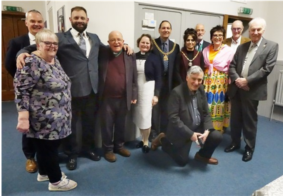
A group of visitors at our Anniversary Service

Padiham Unitarians are liberal Christians who are not bound by creeds but recognise the divine spark in humanity, offering respect and tolerance to all.