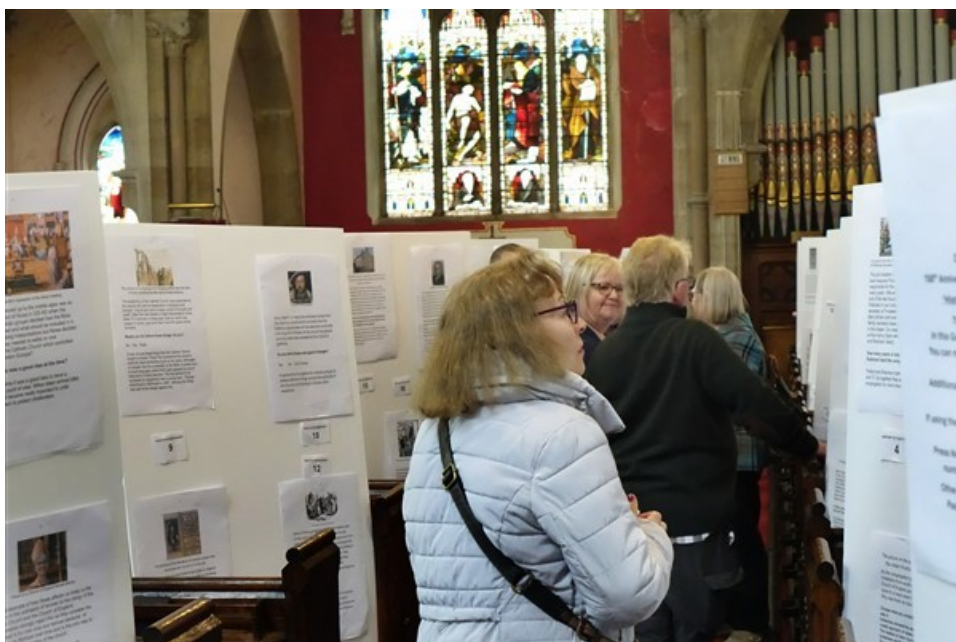
Exhibition held in Chapel on the history of Padiham Unitarian Chapel