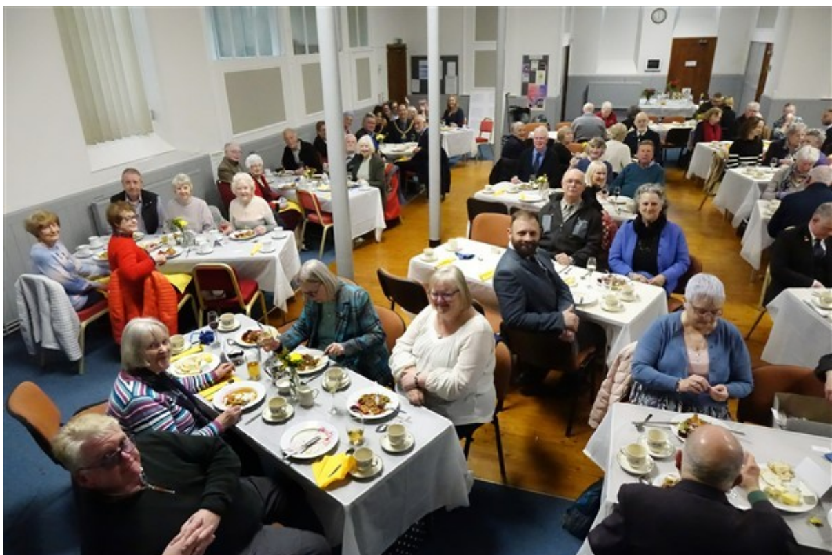
Members of the Congregation enjoying the Anniversary Service Lunch