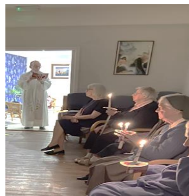
Prayer Vigil with Chaplain