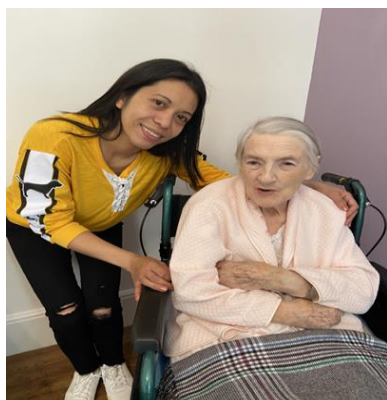
Visits from friends for our elderly members