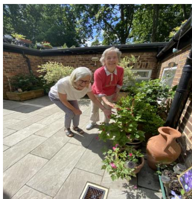
Care of the environment