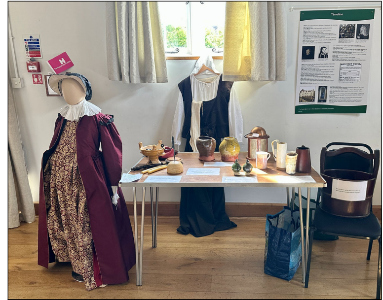
Heritage Open Day at Place House Hall Tudor costumes and household items from Ware Museum