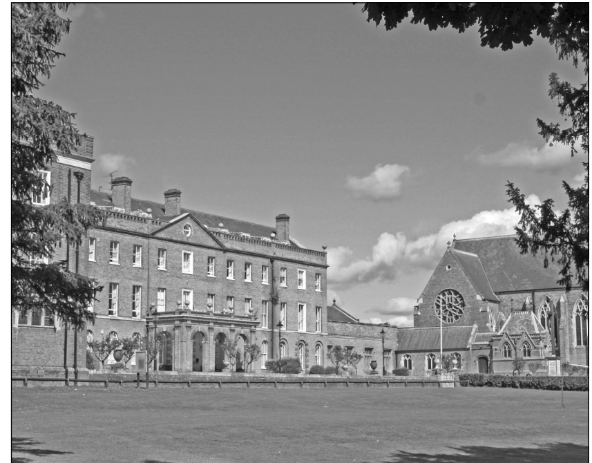
St Edmund's College, Standon