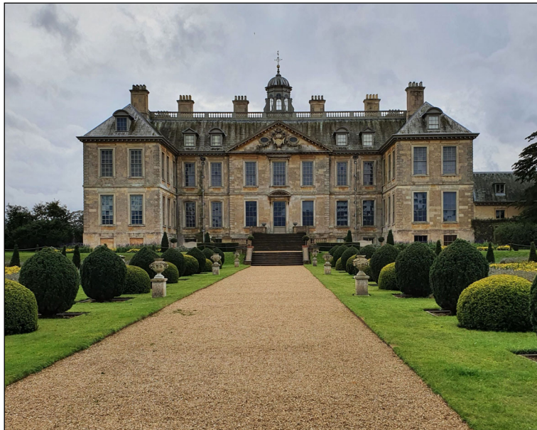
Grade I listed Belton House - featured in 'Royals, Rebels & Aristocrats: the pleasure and the pain of writing about Britain's 'blue-blooded' families'