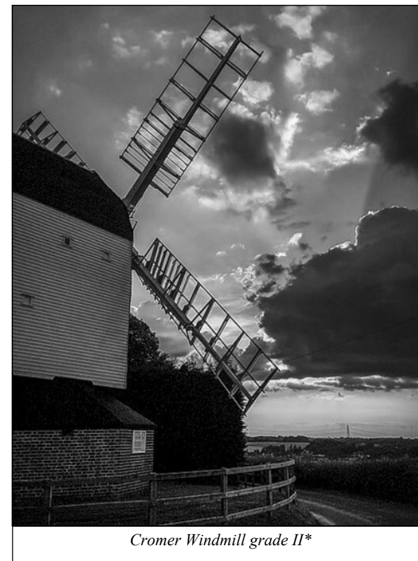
Cromer Windmill grade II*

Liabilities are recognised as expenditure as soon as there is a legal or constructive obligation committing the charity to that expenditure, it is probable that a transfer of economic benefits will be required in settlement and the amount of the obligation can be measured reliably. Expenditure is accounted for on an accruals basis and has been classified under headings that aggregate all cost related to the category. Where costs cannot be directly attributed to particular headings they have been allocated to activities on a basis consistent with the use of resources.