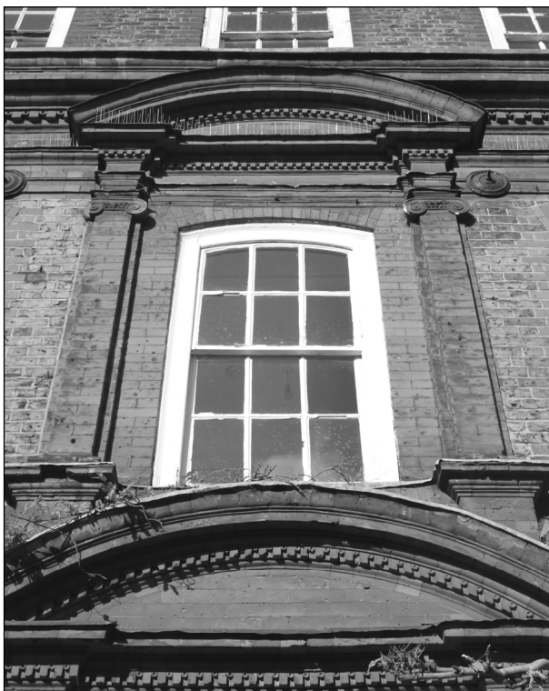
Window detail of Yeomanry House 28, St Andrews Street, Hertford grade II*

This was mainly achieved by taking on more local authority work at the expense of private work. Dacorum Borough Council has rolled over its initial year-long contract, and we are currently