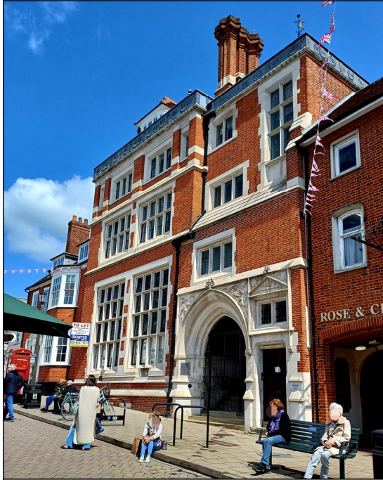
Grade II* 12a Market Place Saffron Walden, subject of a BEAMS Heritage Statement