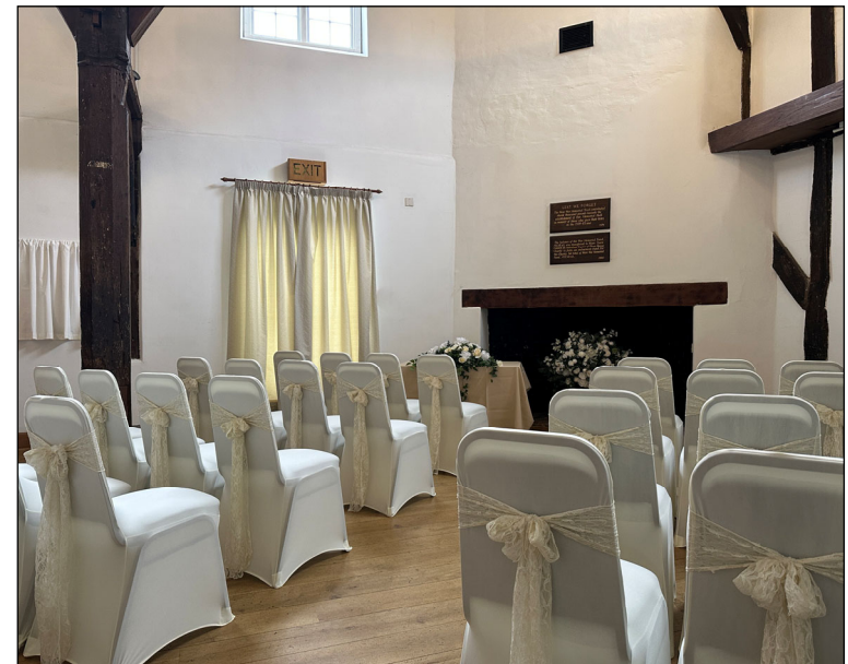
Place House Hall set up for a wedding courtesy of Sioned Rogers Events