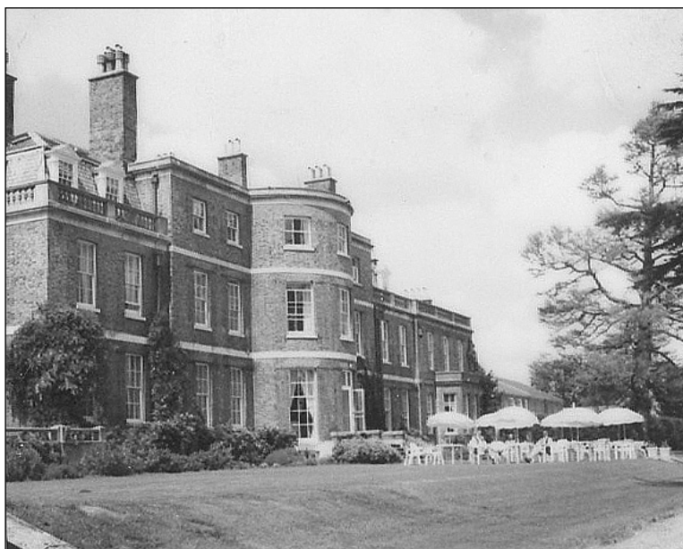
Briggens House Hotel grade II in 1988