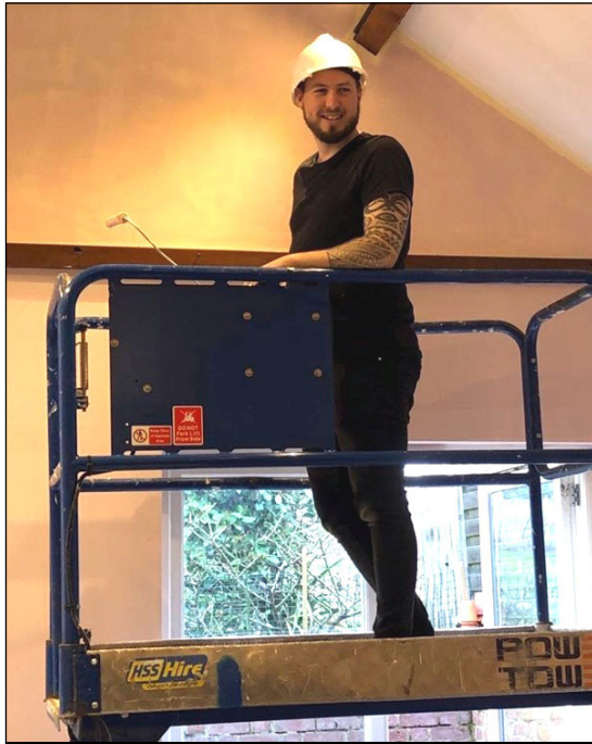
Much Hadham Forge Museum - MAGS@Stansted team help repaint the museum tea room and shop