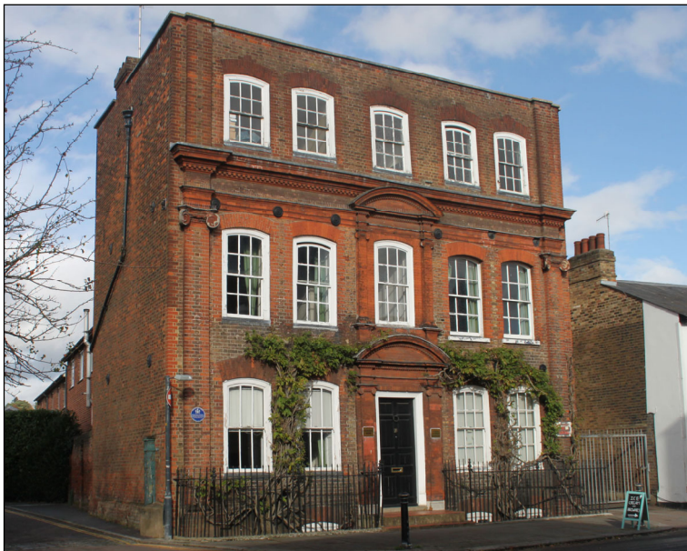
Yeomanry House 28, St Andrews Street, Hertford grade II*, subject of a BEAMS Heritage Statement