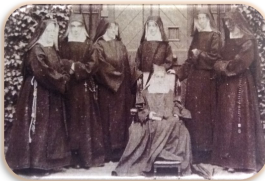
GROUP OF EARLY SISTERS (circa 1874)

Over the next one hundred years, the Sisters responded to calls for help within the UK and Ireland, and further afield: