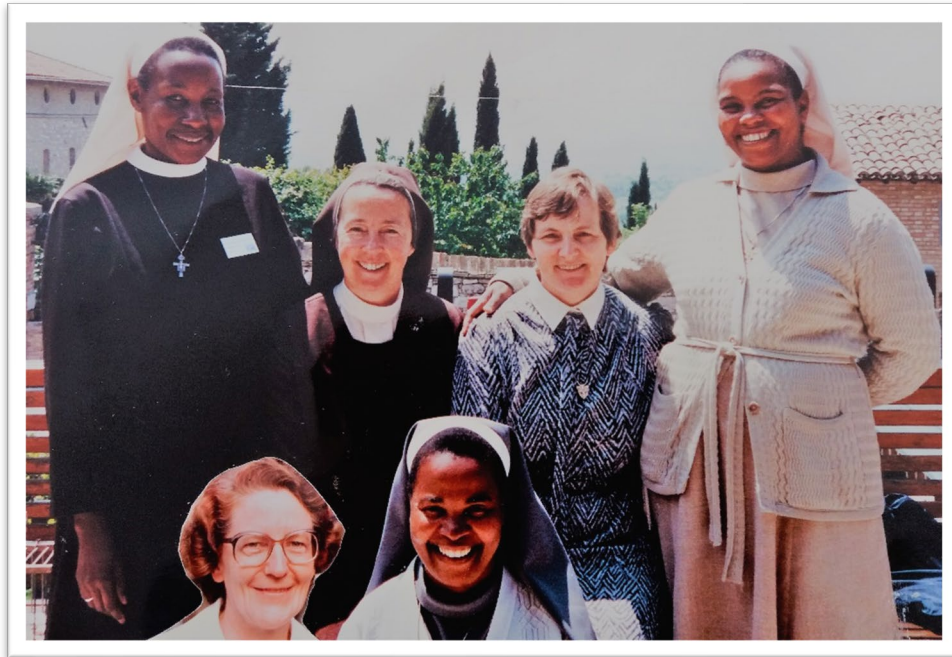
Representatives of the four Congregations: Franciscan Sisters of Mill Hill Franciscan Sisters of Baltimore (now Milwaukee) Franciscan Missionaries for Africa Little Sisters of St Francis (East Africa)

From that one small group of five pioneering women in England in 1868, there have sprung four independent Congregations of Religious Sisters in USA, East Africa, Ireland and UK.