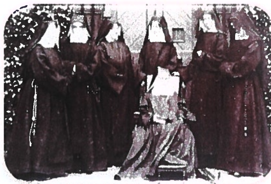
GROUP OF EARLY SISTERS (circa 1874)

Over the next one hundred years, the Sisters responded to calls for help within the UK and Ireland, and further afield: