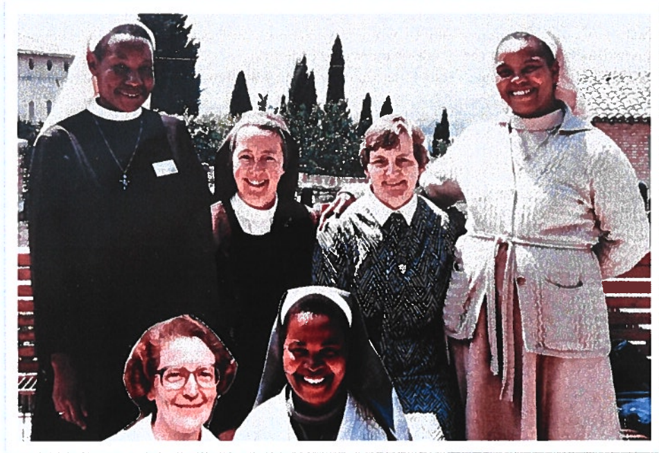
Representatives of the four Congregations: Franciscan Sisters of Mill Hill Franciscan Sisters of Baltimore (now Milwaukee) Franciscan Missionaries for Africa Little Sisters of St Francis (East Africa)

From that one small group of five pioneering women in England in 1868, there have sprung four independent Congregations of Religious Sisters in USA, East Africa, Ireland and UK.