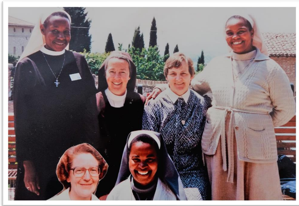
Representatives of the four Congregations: Franciscan Sisters of Mill Hill Franciscan Sisters of Baltimore (now Milwaukee) Franciscan Missionaries for Africa Little Sisters of St Francis (East Africa)

From that one small group of five pioneering women in England in 1868, there have sprung four independent Congregations of Religious Sisters in USA, East Africa, Ireland and UK.