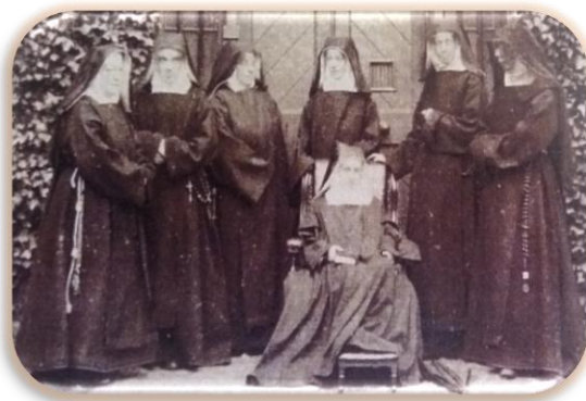
GROUP OF EARLY SISTERS (circa 1874)

Over the next one hundred years, the Sisters responded to calls for help within the UK and Ireland, and further afield: