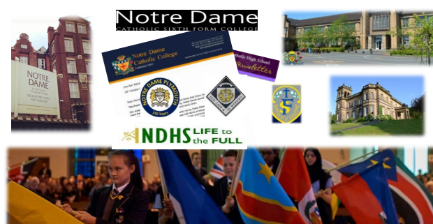
UK NOTRE DAME NETWORK OF SCHOOLS AND COLLEGES TODAY