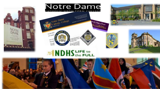
UK NOTRE DAME NETWORK OF SCHOOLS AND COLLEGES TODAY