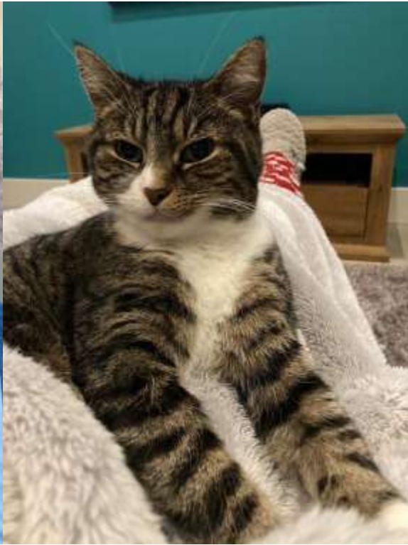
Dave and Elsa in their new home

We also rehomed a number of feral cats and cared for a number of cats which required significant and long term medical treatment. These included two cats, Eliza and Autumn, who both recovered from life threatening conditions, thanks largely to the care and persistence of the foster carers who looked after them.