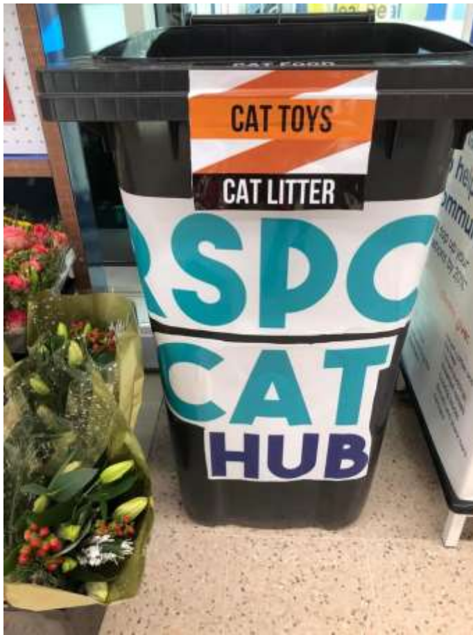
Donation bin in Tesco in Eaglescliffe

By the end of the year we had collection points in Stanhope Park Vets, Burts Carpets in Darlington, Darlington Vet Clinic, Morrisons' Morton Park store, Tesco in Eaglescliffe and in Cummins offices in Darlington. Donations of food and litter play a key role in helping us reduce outgoings.