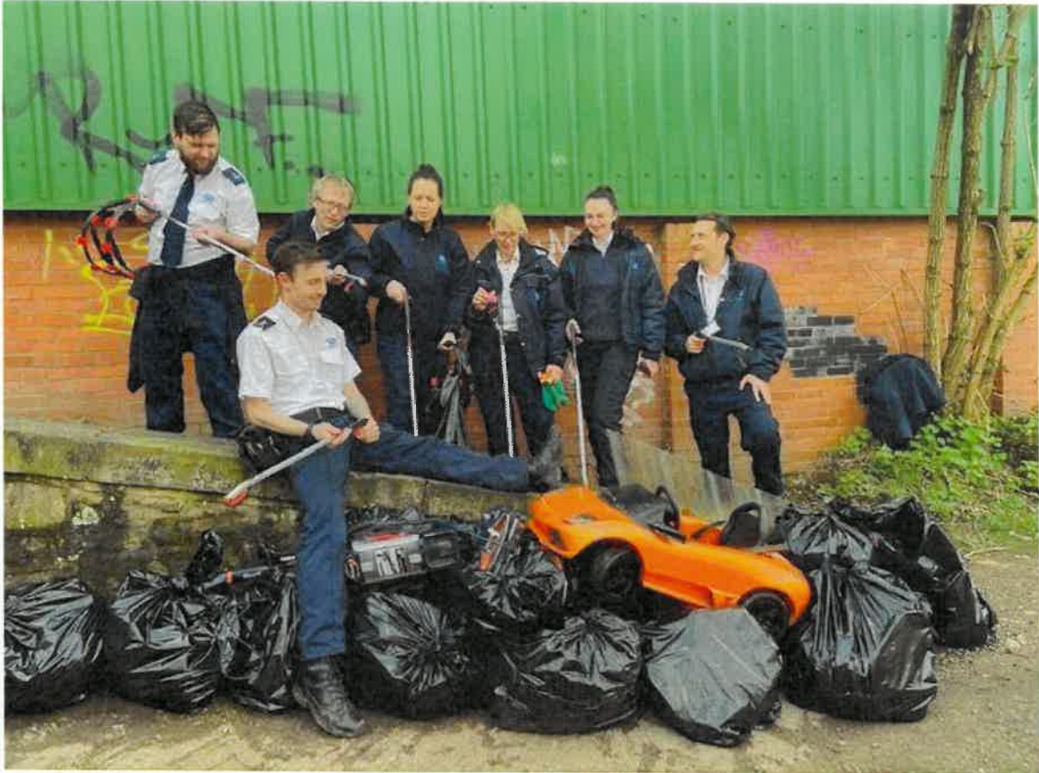
Some of the Manchester officers on a litter pick in 2024.

The team continued to receive vital support from Animal Rescue Volunteers, who assisted with transporting animals to branches and veterinary appointments. This assistance is crucial in freeing up officers to concentrate on investigating animal welfare concerns.