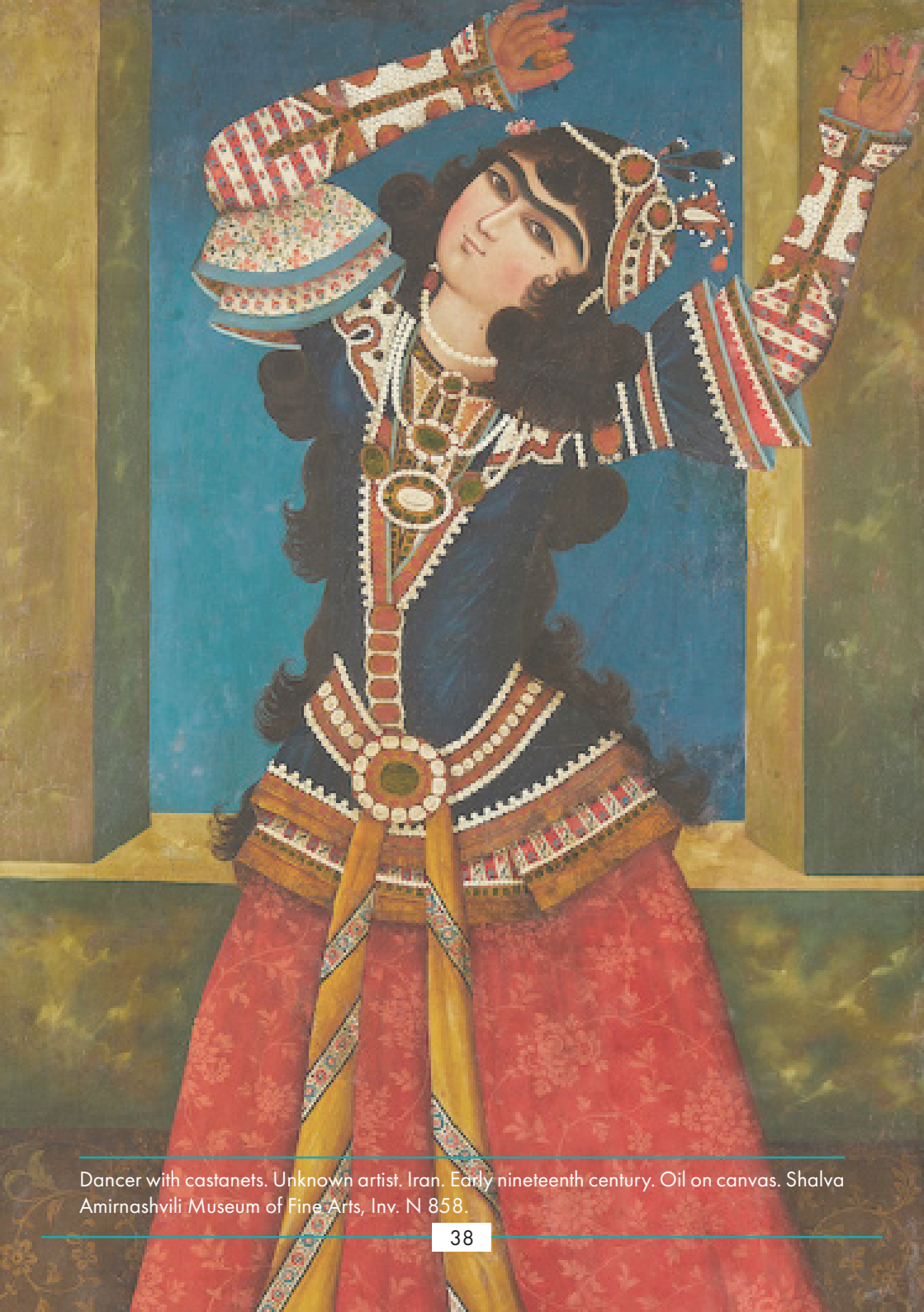
Dancer with castanets. Unknown artist. Iran. Early nineteenth century. Oil on canvas. Shalva Amirnashvili Museum of Fine Arts, Inv. N 858.