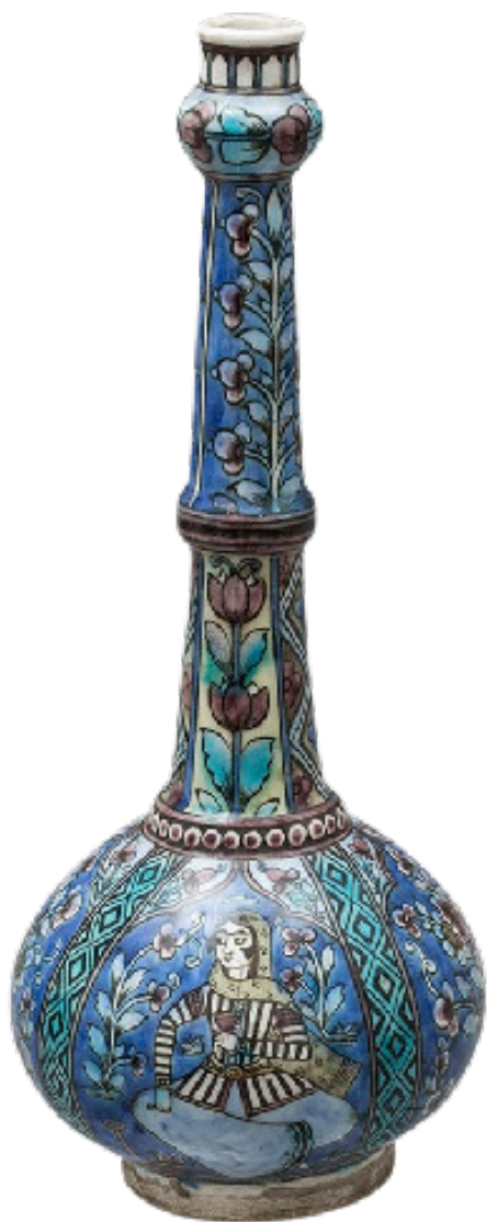
Underglaze-painted bottle. Qajar Iran. Nineteenth century. Islamic Arts Museum Malaysia.