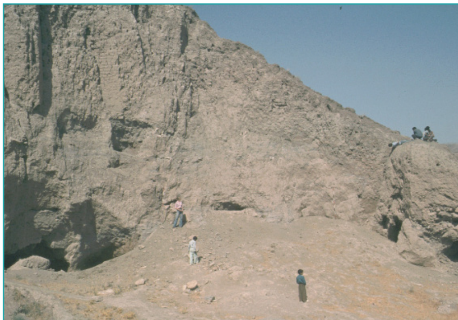
Damage caused by quarrying at the mound of Baba Kamal. From the David Stronach Archive.