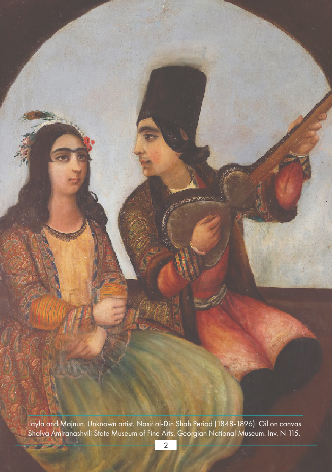
Layla and Majnun. Unknown artist. Nasir al-Din Shah Period (1848-1896). Oil on canvas. Shalva Amiranashvili State Museum of Fine Arts, Georgian National Museum. Inv. N 115.