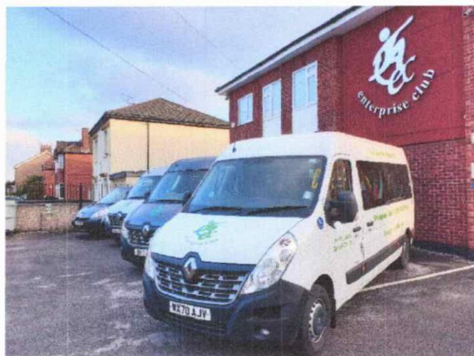
Mini Bus Fleet

A Transport Service is operated by the charity to support the Weekly Activities Programme. Over 85% of the membership of 150 is dependent on accessible transport to enable them to gain access to the facilities. The charity currently owns three accessible mini buses, all of which have been purchased as a result of fund raising ventures, grants and donations.