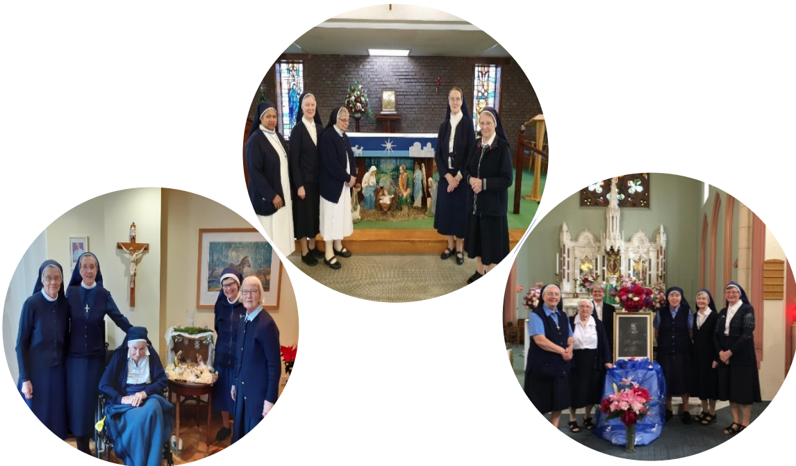
Finchley, Cheltenham and Glasgow Communities

Our Community in Bonnyrigg had a virtual prayer service every Wednesday during the season of Lent and had virtual Stations of the Cross every Friday. Many people linked into these services from near and far. The wonders of technology! All of our Communities had various services to mark different occasions in the church calendar and within our congregation.