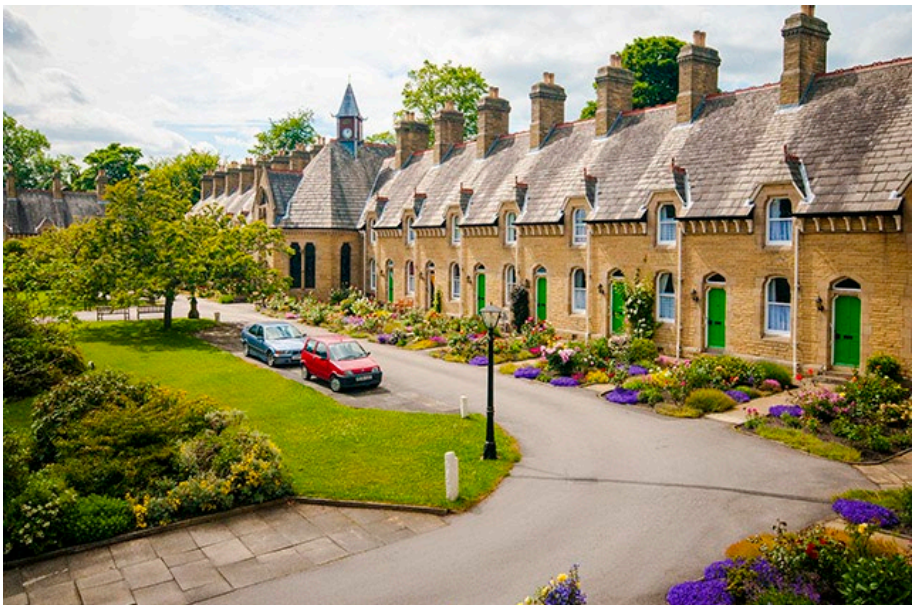
Houses 16-24 above - Houses 7-15 below