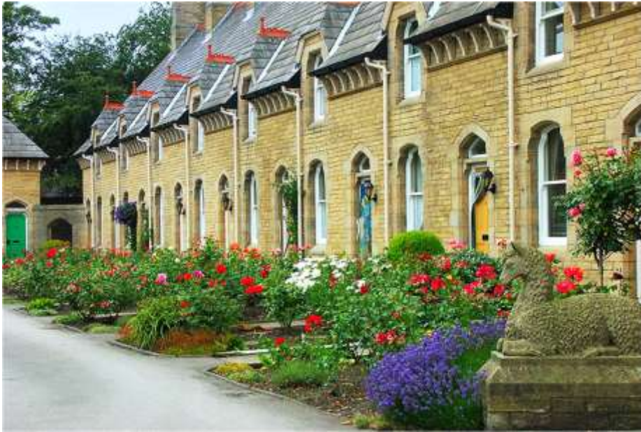
Houses 16-24 above - Houses 7-15 below