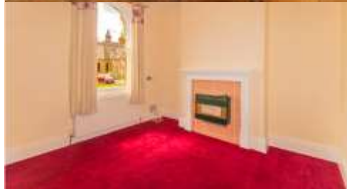
Pictures indicating the interior of a typical almshouse at the Bradford Tradesmen's Homes