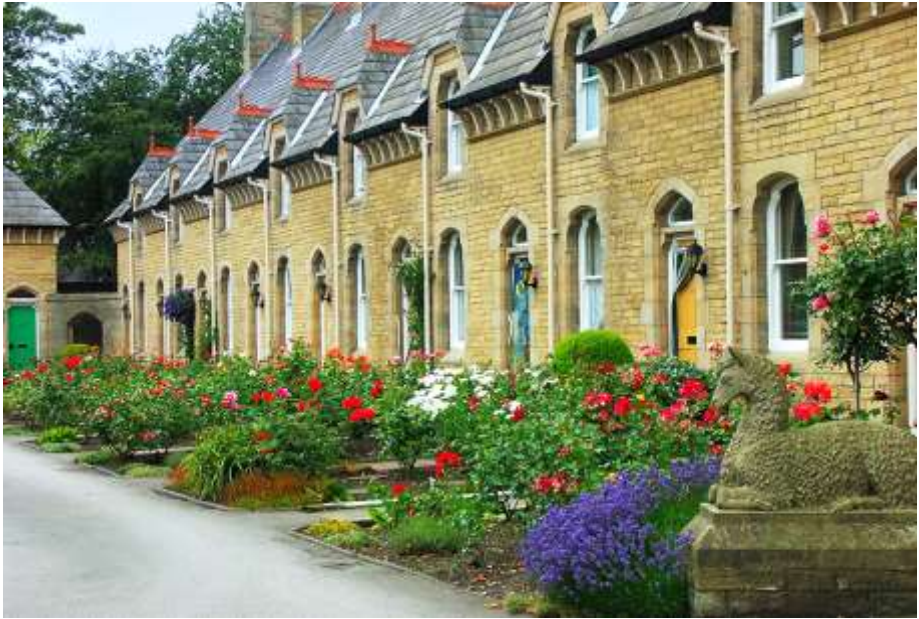
Houses 16-24 above - Houses 7-15 below