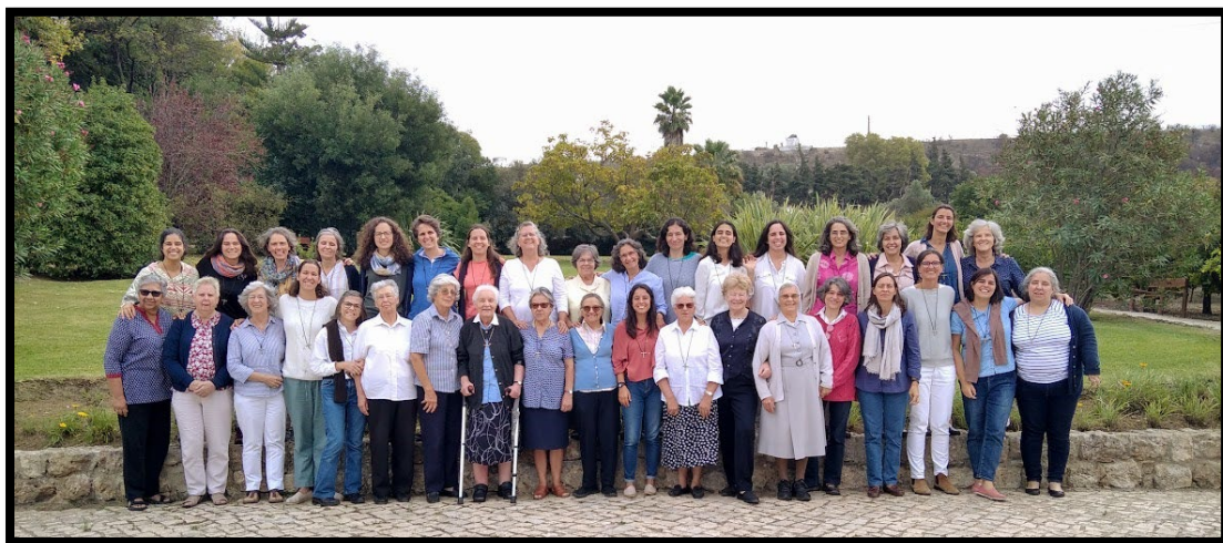
Province Assembly – Palmela – October 2022

In 2014, the Congregation began a new chapter of its history in England, with the establishment of the Atlantic Europe Province, in order to respond to the challenge of a New Evangelization of Europe. The Canonical union took place on 1 January 2014, but it has had no impact on the scope and governance of the Charity itself. The Province includes the communities and apostolic works in the United Kingdom, Ireland, Portugal and France.