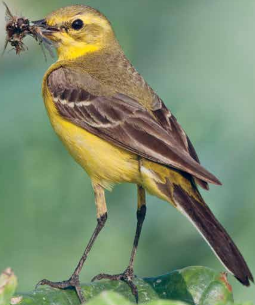
YELLOW WAGTAIL