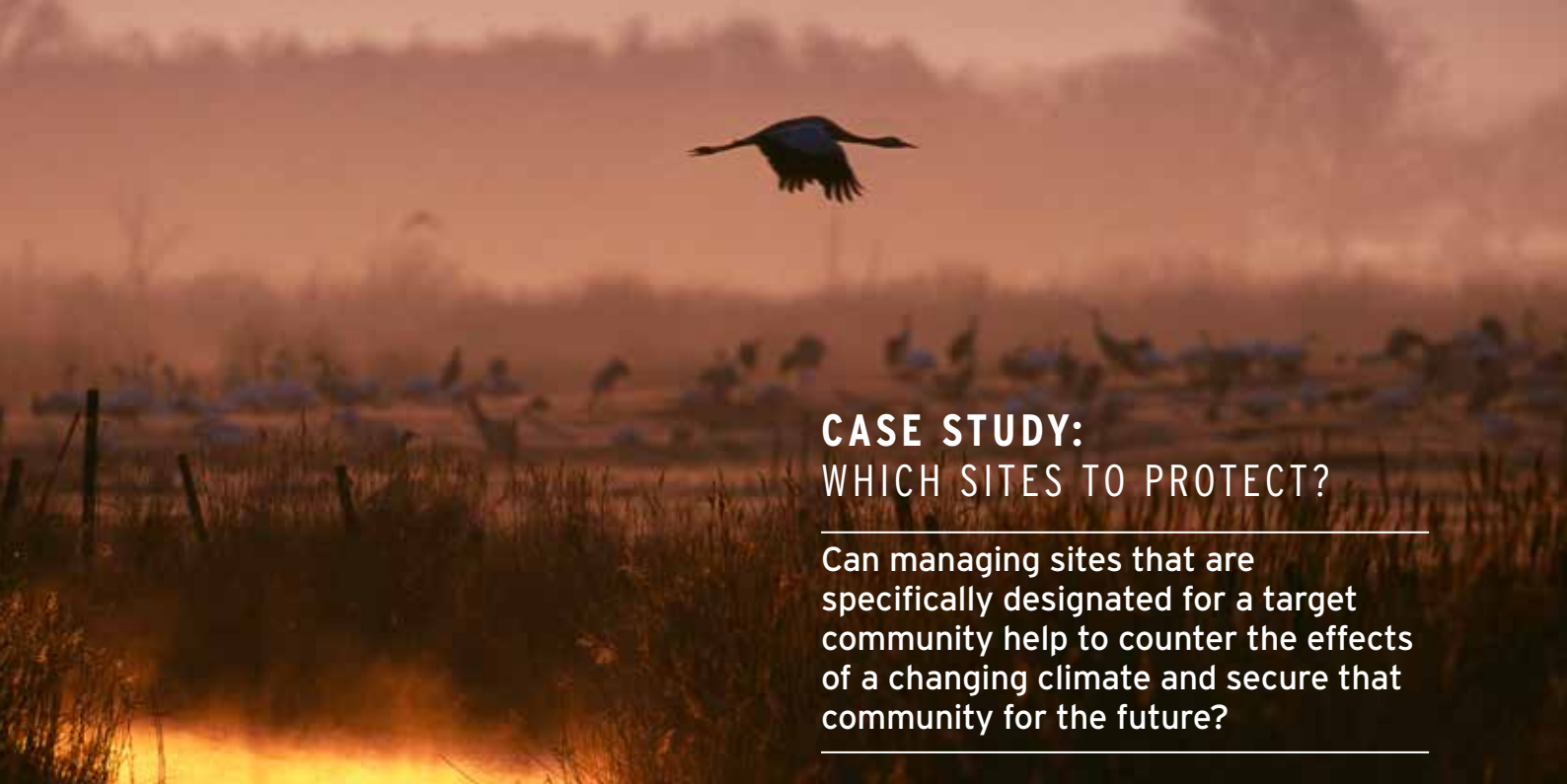
COMMON CRANES

By working collaboratively, and involving the Welsh Government throughout the process, this work has delivered valuable evidence to support policy development. The outputs will support Welsh Government as it seeks to develop programmes that manage the Brexit transition pro-actively, while mitigating risks to the agricultural sector, the environment, and rural communities.