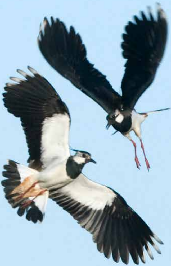
LAPWINGS

If you would like to know more about any of the projects or how you might support our work, please contact: fundraising@bto.org