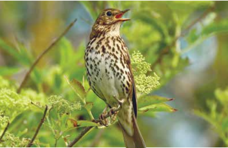
SONG THRUSH : TOM CADWALLENDER / BTO

It is thought that online training in both bird identification and BTO-led projects, introduced during the first lock-down in 2020 and latterly combined with field trips in a ‘hybrid’ approach, has helped BTO reach out to a new audience in Northern Ireland. Enthusiastic and knowledgeable local representatives, who can provide one-to-one mentoring and support, are absolutely vital in Northern Ireland. Building and maintaining this network has been a priority over the last few years. Engagement and training work continues, with hybrid courses in the Wetland Bird Survey, BBS and the Nest Record Scheme delivered this year.