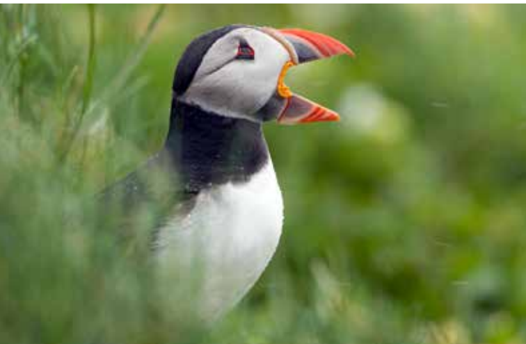
PUFFIN

Our spring appeal raised vital funds to help improve seabird monitoring efforts. UK breeding seabird populations have declined by a quarter since 1986, and we urgently need a better understanding of why. Due to the remote nature of many seabird colonies, there are significant gaps in the data that could provide crucial answers. Supporters responded generously, donating to fund a programme to recruit, train and support seabird surveyors across the UK, helping to provide compelling evidence to incite the action our seabirds so sorely need. We kicked this off with a series of online training courses for the public, aimed at increasing confidence in seabird identification, while raising awareness of their ecology and population declines. A total of 476 supporters joined us to learn about the 25 species that breed in the UK and the major conservation issues they face.