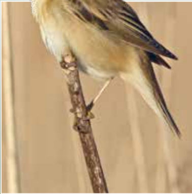
CURLEW CHICKS AND CURLEW FIELDWORK; SEDGE WARBLER