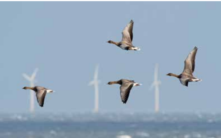
GEESSE AND WINDFARM

Whilst wind energy developments help to reduce carbon budgets, they may also impact bird populations through the increased mortality from collisions, the modification of habitats used by the birds, and changes to foraging behaviour, as birds avoid renewable infrastructure such as offshore wind farms. BTO work on collision risk models, which are used to estimate the potential mortality caused by wind turbines, has been of particular importance in this regard, as a study published in 2021 reveals (Masden et al. 2021).