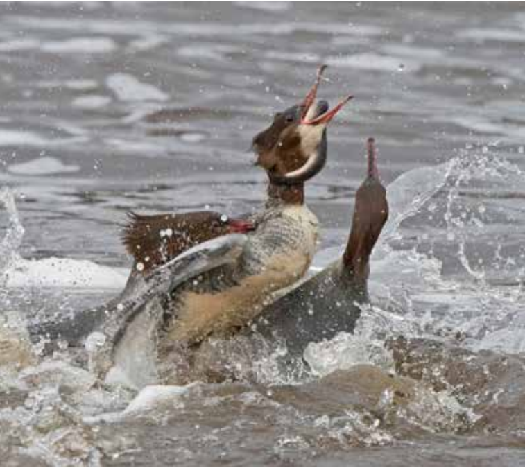
GOOSANDERS

The project delivered modelled distributions and population estimates for both Cormorant and Goosander for the 10 rivers, their wider catchments and (extrapolated) population estimates for all-Wales, and provided these and the underpinning data to Natural Resources Wales and the Fish-eating Birds Advisory Group at the end of the winter (and BTO’s financial year).