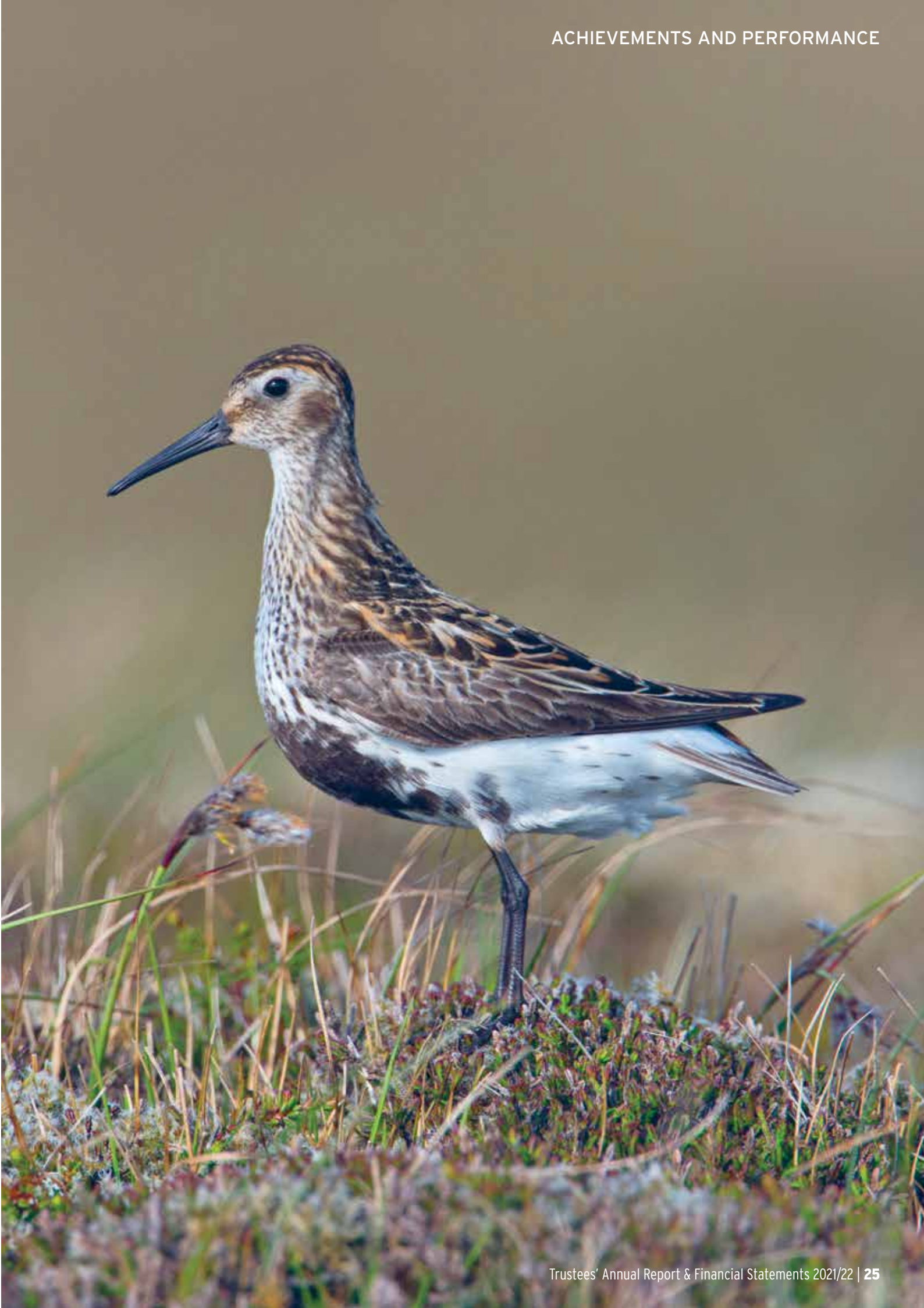
DUNLIN; FIGURE SHOWS THE NUMBERS OF UPLAND BREEDING BIRDS IN EACH CATEGORY / FROM PEARCE-HIGGINS (2021)

As is evident from some of the other BTO work reported in this Annual Report, BTO researchers have been working with others to understand the resilience of protected sites and reserves for birds under a changing climate. The Climate Change and the UK's Birds report underlines that the maintenance of an extensive network of large sites that protect important natural and semi-natural habitats, such as the Special Protection Areas established under the EU Birds Directive, will play an important continent-wide role in the conservation of birds in a changing climate. There is also growing evidence that how we manage that land will also be important.