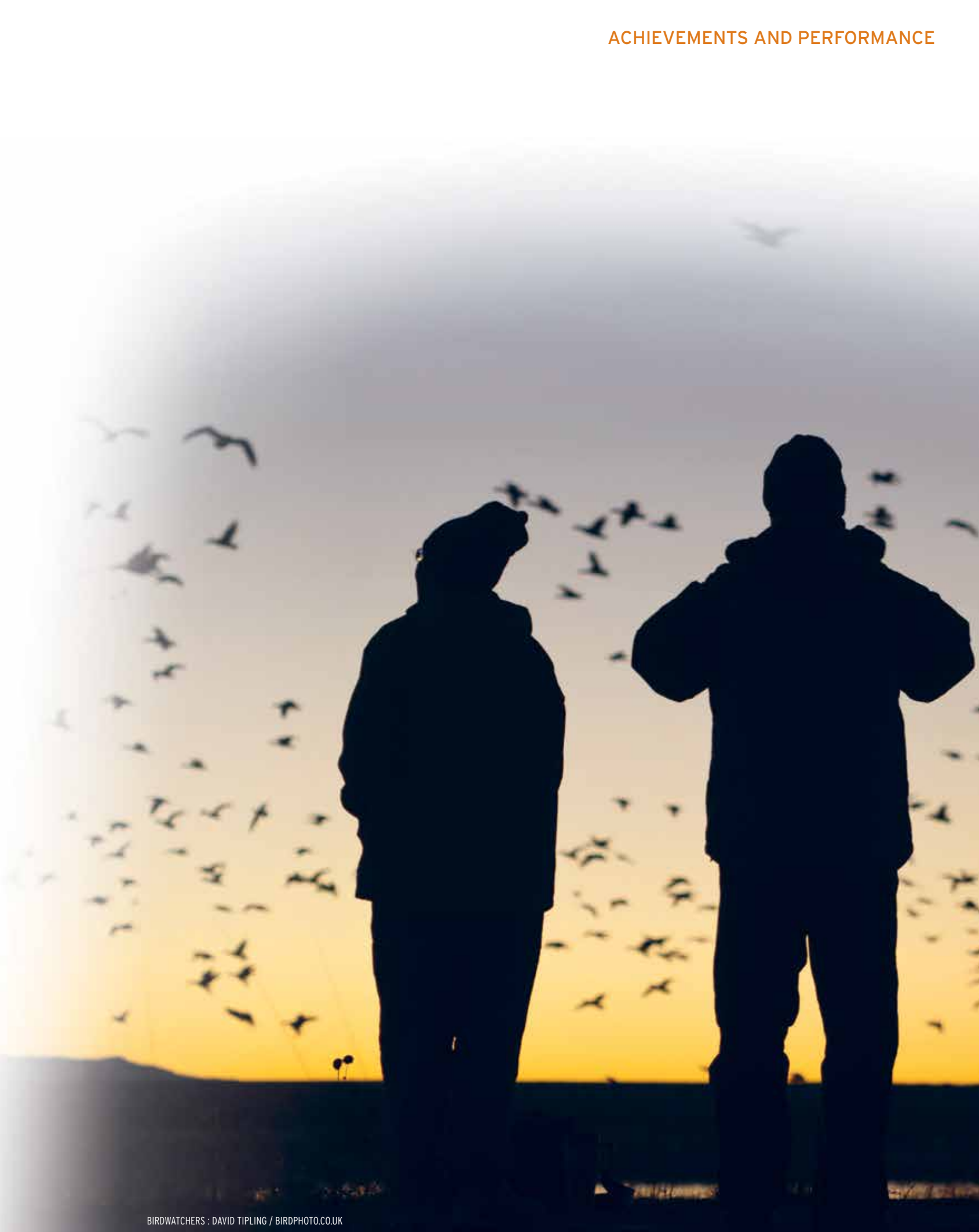
BIRDWATCHERS

We will raise the profile of science communications with key audiences, including volunteers, collaborators, funders and decision-makers, to ensure our science is prominent and accessible. By doing all of this we will deliver the impact that is both needed and expected of us as a Registered Charity.