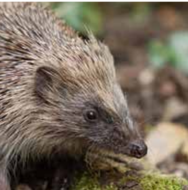
WHEATEAR : YELLOW WAGTAIL : DARK BUSH-CRICKET : HEDGEHOG