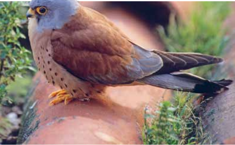
LESSER KESTREL

GARGANEY