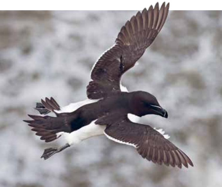
RAZORBILL

Because of the gaps in our understanding, BTO identified an urgent need to recruit, train and support a new generation of volunteers. Thanks to the generosity of our supporters, contributing to the 'Our Lost Seabirds Appeal', we have been able to develop a series of new initiatives and resources directed towards seabird monitoring.