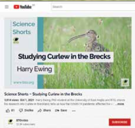
CURLEW