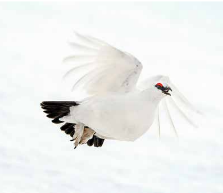
PTARMIGAN