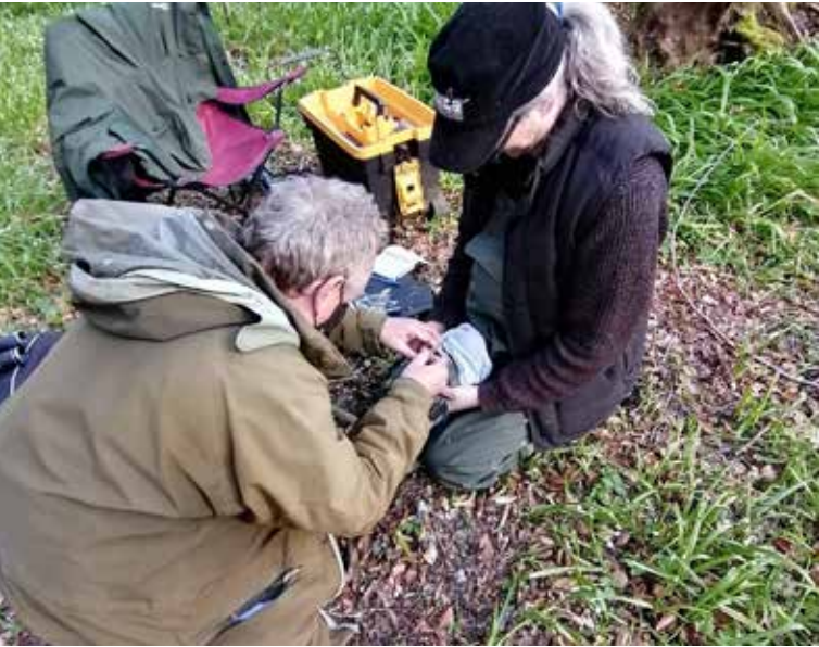
TAGGING GOOSANDERS / BTO

There are two particular challenges in deploying and using these devices on Goosanders; the first is that Goosanders are difficult birds to catch, the second is that they are adept at removing the devices, which typically only remain on the bird for a couple of weeks. The BTO Scotland team has developed a safe method for catching the Goosanders using mist nets positioned across shaded river sections. So far, 11 birds have been captured on two river systems, the River Devon – a tributary of the River Forth in Clackmannanshire – and the River Tweed in the Scottish Borders. Interesting differences in the movements of birds on the two rivers have been revealed, and it is hoped that the information gained will help to inform the debate about the impacts of these fish-eating birds on fish stocks. This important work was funded through the generosity of Mark Constantine, to whom we are extremely grateful.