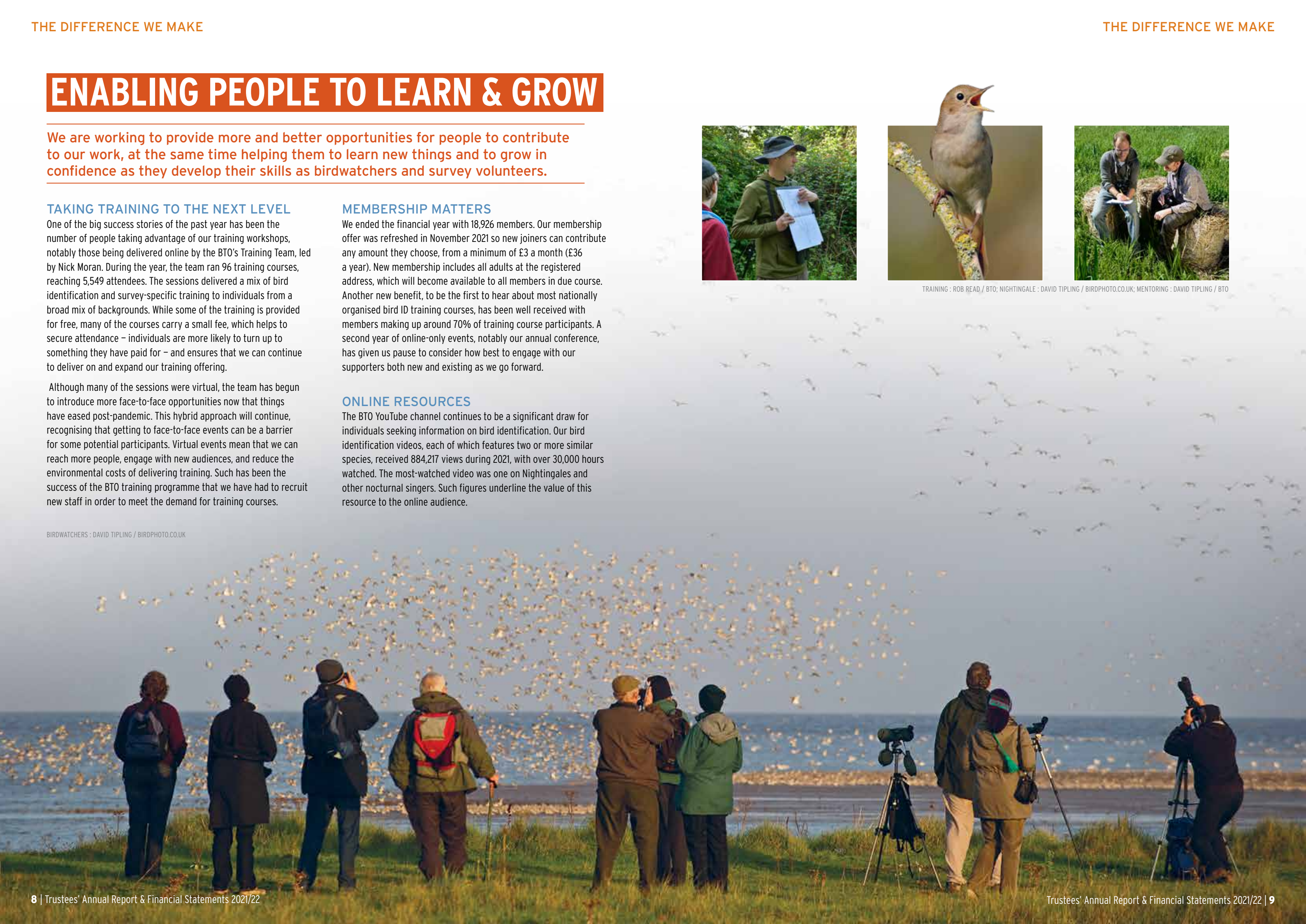
BIRDWATCHERS