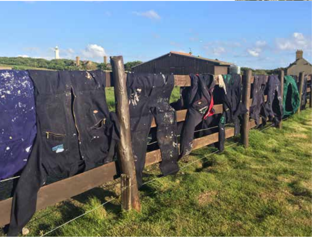
RINGING CLOTHING FROM A SEABIRD SESSION

As is evident throughout this year's annual report, there is a huge appetite to grow our volunteer networks and, alongside this, provides opportunities for more people from more backgrounds. The knowledge that, collectively, our passion, actions and financial contributions make a difference means that we are even more determined to inspire others, inform decision-makers and stimulate a deeper public understanding about the state of the natural world. In return, and through their involvement with us, our volunteers benefit from improved well-being, a stronger connection with nature, a better understanding of birds and the environment, and the knowledge that they are contributing positively to society.