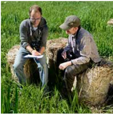
TRAINING; NIGHTINGALE; MENTORING