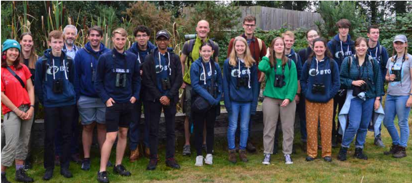
CLOCKWISE FROM TOP LEFT: YOUNG LEADERS COURSE / BTO; YOUTH ADVISORY PANEL MEETING OUR PATRON / KENSINGTON PALACE; BTO YOUTH GET-TOGETHER : BTO; BTO/MARSH TRUST AWARDS : MARTIN SYLVESTER