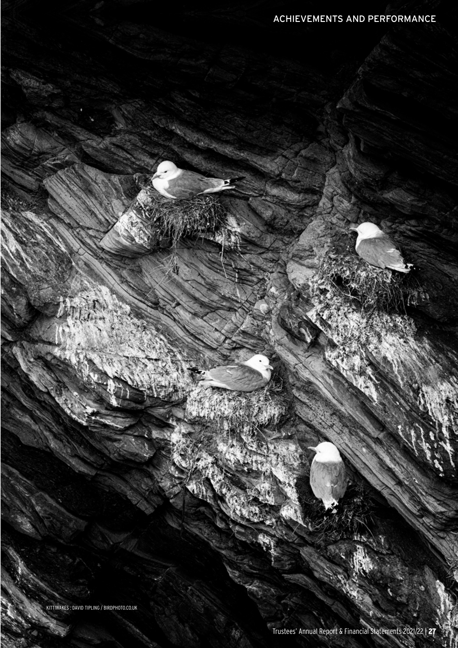
KITTIWAKES