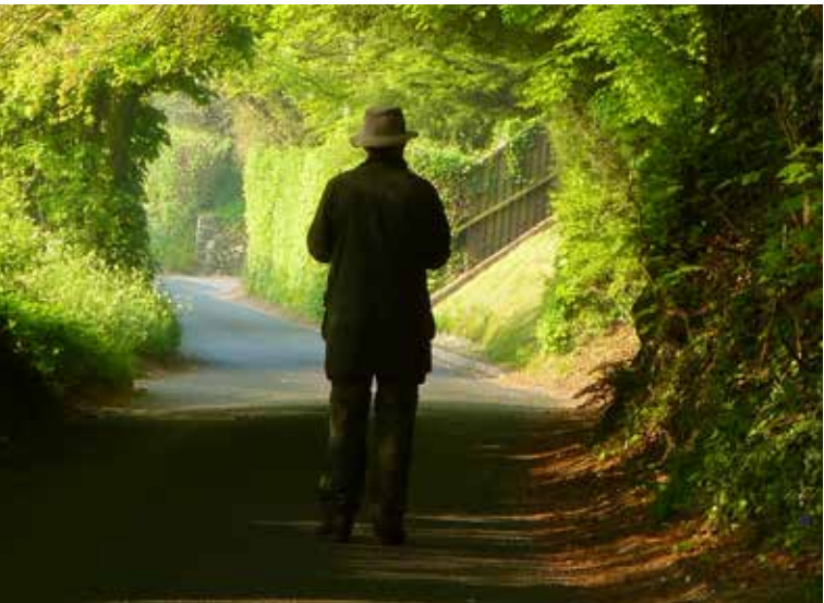
BBS VOLUNTEER : JILL TARDIVEL / BTO

During 2021, the Pan-European Common Bird Monitoring Scheme (PECBMS) delivered its latest database of between-year and long-term changes for 170 species, the data collected by thousands of volunteers across 28 countries (Brlík et al. , 2021). This publicly available dataset is being used to answer research questions, report on international biodiversity targets, support policy work, and assess conservation efforts. That these data are available, and are continuing to play such a vital role, is testament to the incredible efforts of the volunteers who contribute each year.