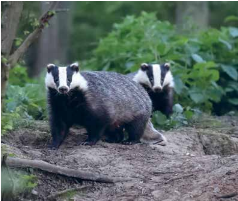
BADGERS : LIZ CUTTING / BTO

By using passive acoustic monitoring devices, deployed in the gardens of local birdwatchers to record the calls of nocturnally migrating Redwings, Blackbirds and Song Thrushes, Gillings and Scott examined a gradient of nocturnal illumination in Cambridgeshire – from the brightly lit city of Cambridge to the darker surrounding villages and countryside. The audio recordings were analysed using artificial neural networks, which had been trained to identify calls of the target species and differentiate them from other sources of night-time noise. The results showed that thrush call rates were up to five times higher over the brightest urban areas than in the darkest villages, suggesting a strong effect of artificial light on these migratory species. Although evidence