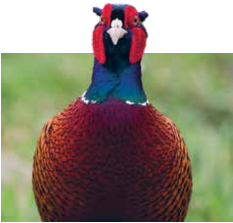
PHEASANT