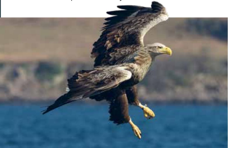
WHITE-TAILED EAGLE