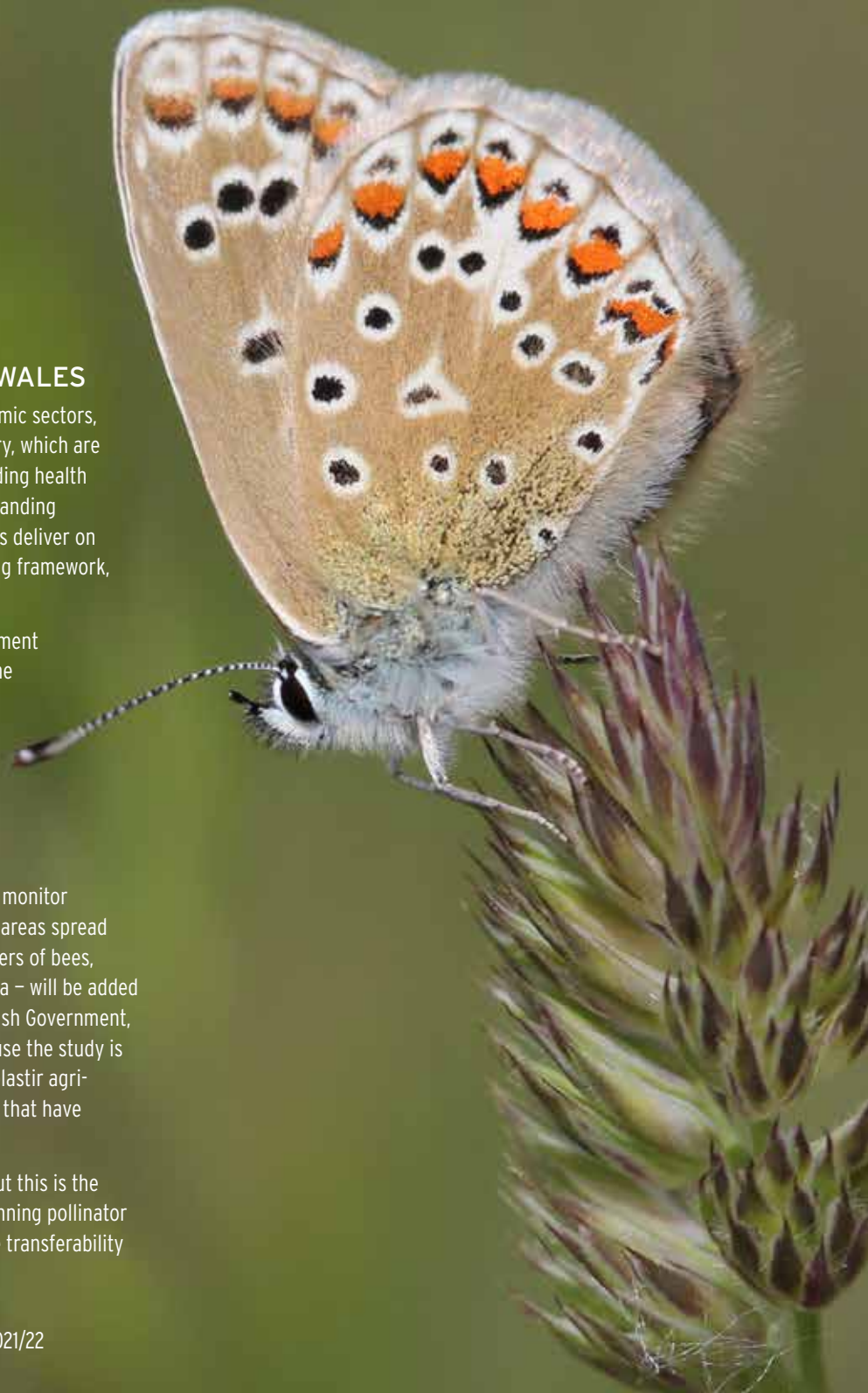
COMMON BLUE

Fieldwork targeting birds is taking place in 2022, but this is the first time that BTO has been directly involved in running pollinator surveys of this kind, something that underlines the transferability of our expertise in monitoring work.