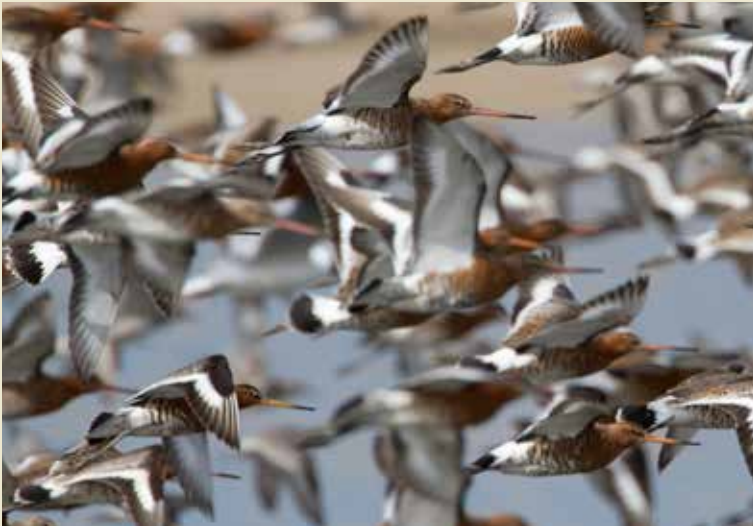
BLACK-TAILED GODWITS

Protected area networks are a conservation tool that can facilitate these responses to climate change, but it is unclear which management approaches are most effective at delivering this. Two pieces of work published during the past year examine this question, both of which use data collected through the Wetland Bird Survey (WeBS) – a partnership jointly funded by BTO, RSPB and JNCC, with fieldwork conducted by volunteers. The WeBS data used are from the January count dataset, which forms the UK contribution to the International Waterbird Census – the wider dataset examined in these two papers.