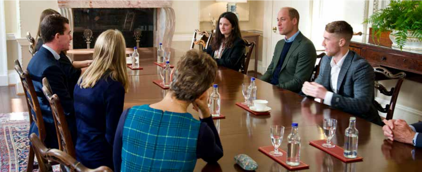
BTO YOUTH ADVISORY PANEL MEMBERS MEETING HRH THE DUKE OF CAMBRIDGE : KENSINGTON PALACE

The BTO Youth Advisory Panel has proven a springboard for new projects and schemes for young people. These schemes help them develop their skills and enjoyment of birdwatching and to become more actively involved in collecting the information that underpins our understanding of what is happening to the UK's bird populations. One of the most popular schemes that the Panel has initiated is the Equipment Donation Scheme. The scheme enables birdwatchers to donate surplus binoculars, telescopes and bird identification guides, to BTO to distribute to young people who cannot access or afford such equipment themselves. So far over 1,800 young people have benefited from the scheme.