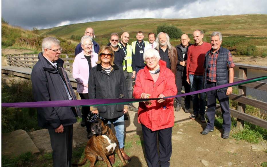
The official opening of the new bridge at Wards Reservoir Belmont, near Bolton