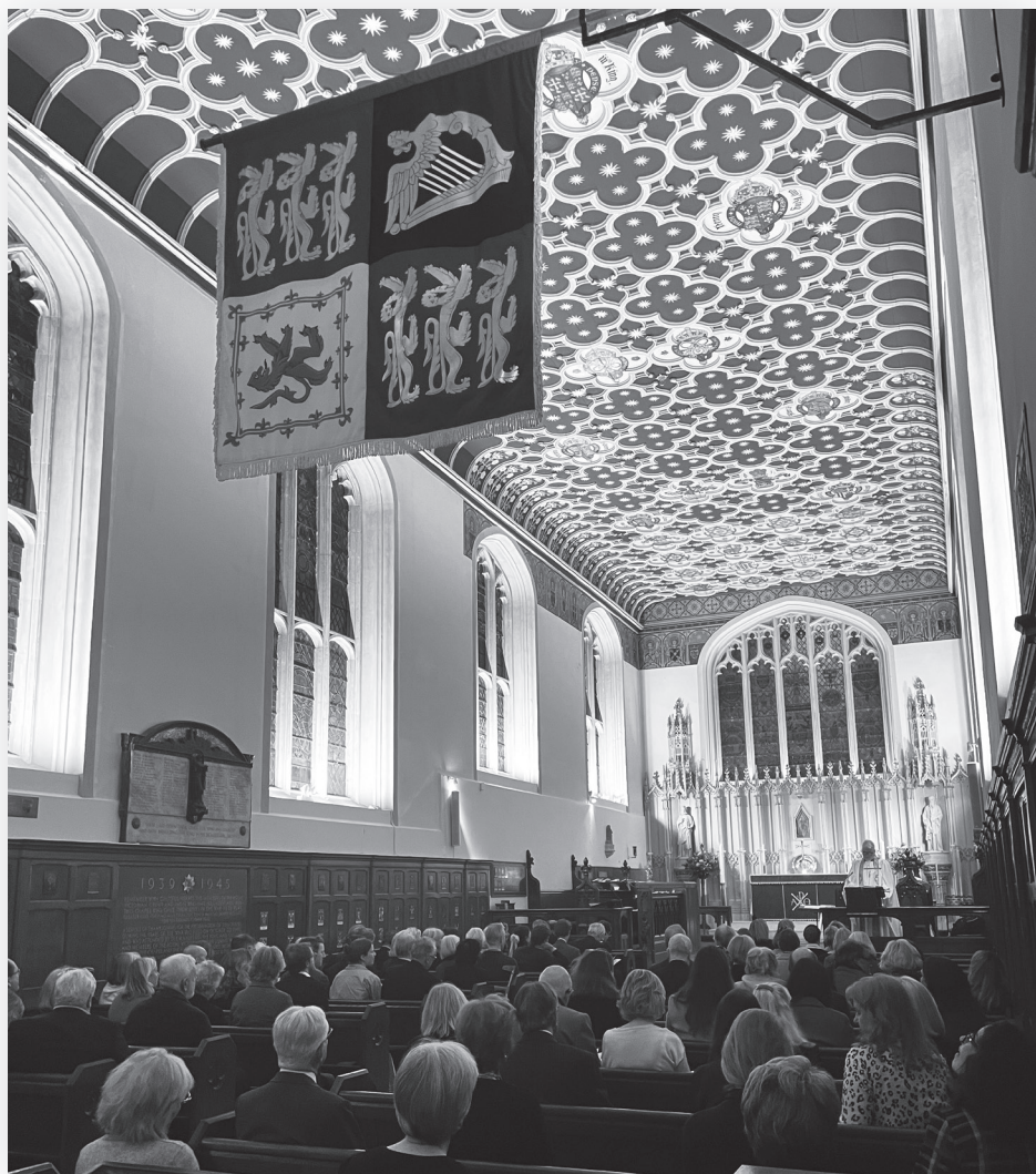
Our first QMCG Carol Service held at The King's Chapel of the Savoy on 4th December 2024.