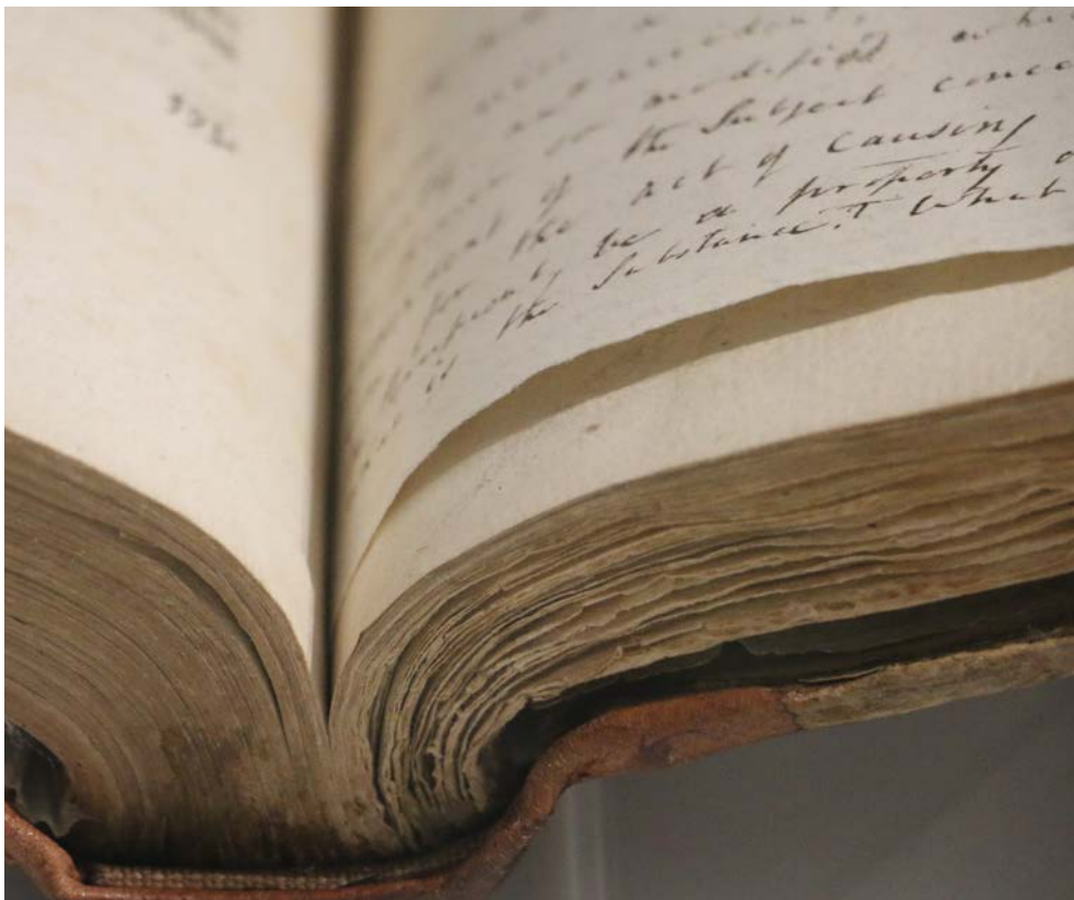
Detail of Swedenborg's Oeconomia Regni Animalis with annotations by ST Coleridge included in the exhibition The Story of Swedenborg in 27 Objects .