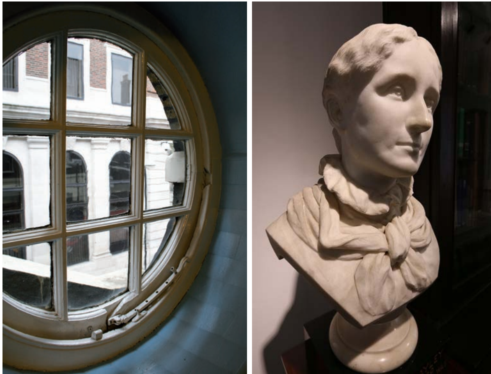
Photograph of interior and of the marble bust of Hannah Bayley, on display in the Wynter Room.

Swedenborg House continues to use environmentally friendly materials and solutions whenever possible and seeks continually to improve its environmental impact. Large amounts of paper and cardboard are sent for recycling and 'triple life' light bulbs are used in light fixtures throughout the building as appropriate. All staff walk or travel to work using either public transport or bicycles, and wherever possible recycling options are always selected when purchasing materials for business usage. New insulation measures and a new temperature controlled heating system are being planned for early 2022 which will improve our ECB rating and provide greater energy efficiency.