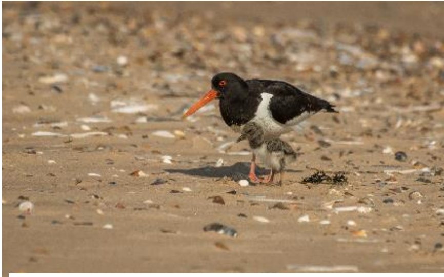
13 pairs of oystercatcher bred at Holme Dunes

Thanks to funding from the Borough Council of King's Lynn and West Norfolk Habitats Monitoring and Mitigation (HMM) Fund, and our partnership with the ENDURE sand dunes project led by Norfolk County Council, we were able to provide support to our vulnerable beach-nesting birds at Holme Dunes , such as oystercatcher, ringed plover and little tern.