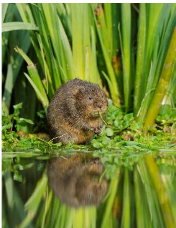
Water vole

The 36-hectare site, part of which was arable farmland until as recently as the late 1990s, lies beside the River Wensum, close to the city centre. The site is a mosaic of fen, rough meadow, grazing marsh, old hedgerows and young woodland, and is home to rare and scarce species of plant and animal, including water vole, water shrew, common toad and frog, orchids, reed bunting, willow warbler and snipe.