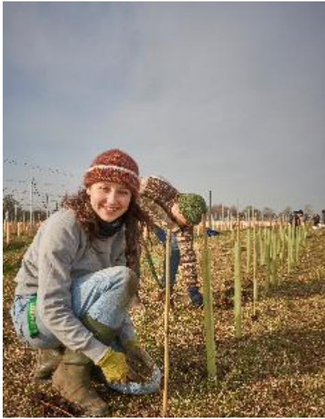
Volunteers planted 1.8km of hedgerows as part of our Claylands Wilder Connections project