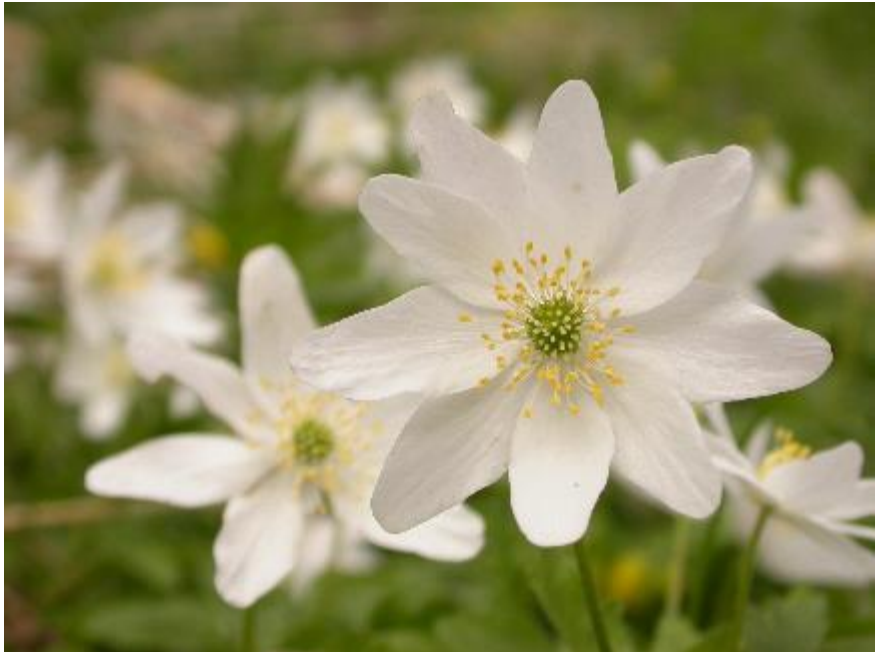
Wood anemone began to regenerate in newly coppiced areas of Honeypot Wood and Foxley Wood

By acquiring the Foxley Wood enclave we returned a missing five-hectare jigsaw piece, sharing three boundaries with our existing site, to this ancient wood. Natural regeneration began in earnest with trees including blackthorn, common hawthorn, field maple and oak coming up, and ground flora including wood sedge, primrose and dog's mercury starting to establish.