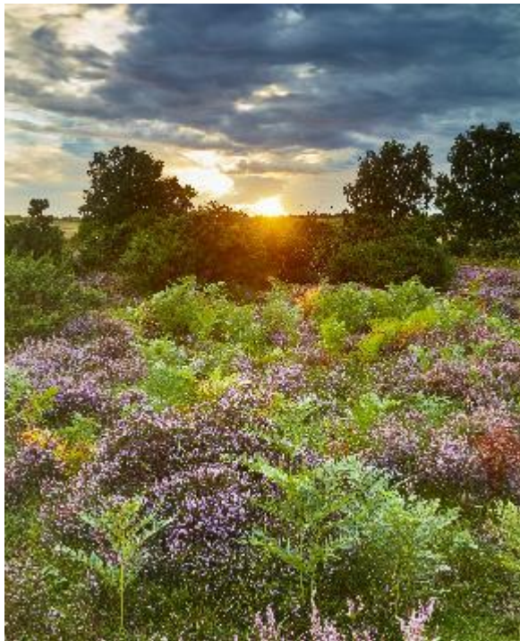
An exploration into the feasibility of peat restoration began at sites including Roydon Common

We continued to work alongside local landowners, Norfolk County Council, Norfolk Farming and Wildlife Advisory Group, Norfolk Rivers Trust, The Nature Conservancy and Anglian Water on the development of the innovative Wendling Beck Environment Project (WBEP). WBEP represents a ground-breaking approach to conservation and land management in England, which ultimately will be financed by the sale of ecosystem services such as biodiversity net gain, natural flood management, along with regenerative farming. 809 hectares of land running along the Wendling Beck chalk stream feature within the project area, including NWT's Beetley Meadows and Hoe Rough . We are advising on the best ways to manage land for wildlife, create and restore habitats and ensure resilience for nature. This partnership project is supported by the Natural England Investment Readiness Fund.