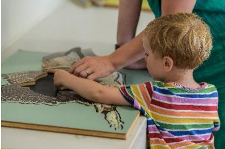
We welcomed over 180,000 people to our visitor centres

One step on this journey was to create a new role to lead a cross-organisation working group, committed to transforming and nurturing Norfolk Wildlife Trust's equality, diversity and inclusivity (EDI).