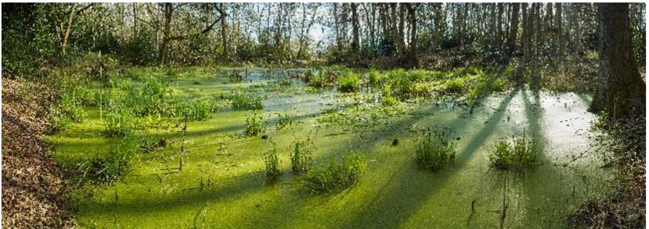
Thompson Common

We were excited to learn that our work is being mirrored by the Woodland Trust who have recently purchased farmland to the west of Thompson Common . We hope to develop a long-term vision for the wider landscape together, sharing ideas and best practice for the benefit of our sites and their wildlife.