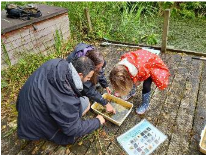
We engaged with 35 different schools

Our education team continued to connect families and young people with nature, delivering a mix of