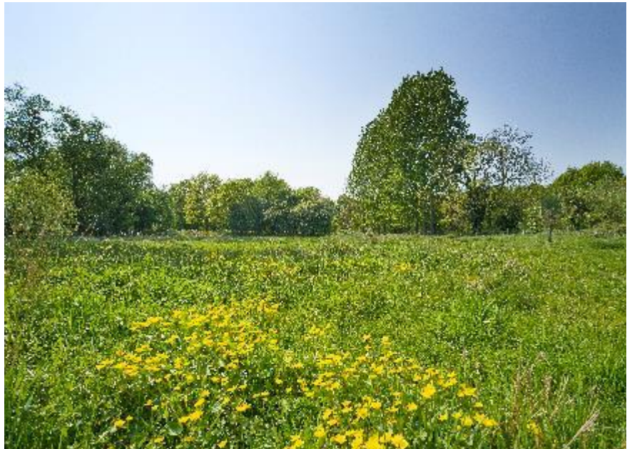
Hoe Rough, marsh Marigolds

We were delighted to win the tender to work in partnership with the Environment Agency (EA) to manage Potter Heigham reedbed for a further 25 years. By following an agreed management plan, we will ensure the site continues to provide a safe haven for reedbed and wetland specialists such as bittern, marsh harrier, common crane and otter, as predicted sea level rise begins to impact reedbeds on the North Norfolk coast. Elsewhere in the Broads, our partnership with the EA saw us creating new reedbed at Hickling Broad ,