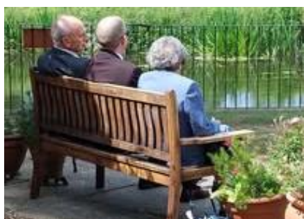
Wedding guests enjoy a contemplative moment