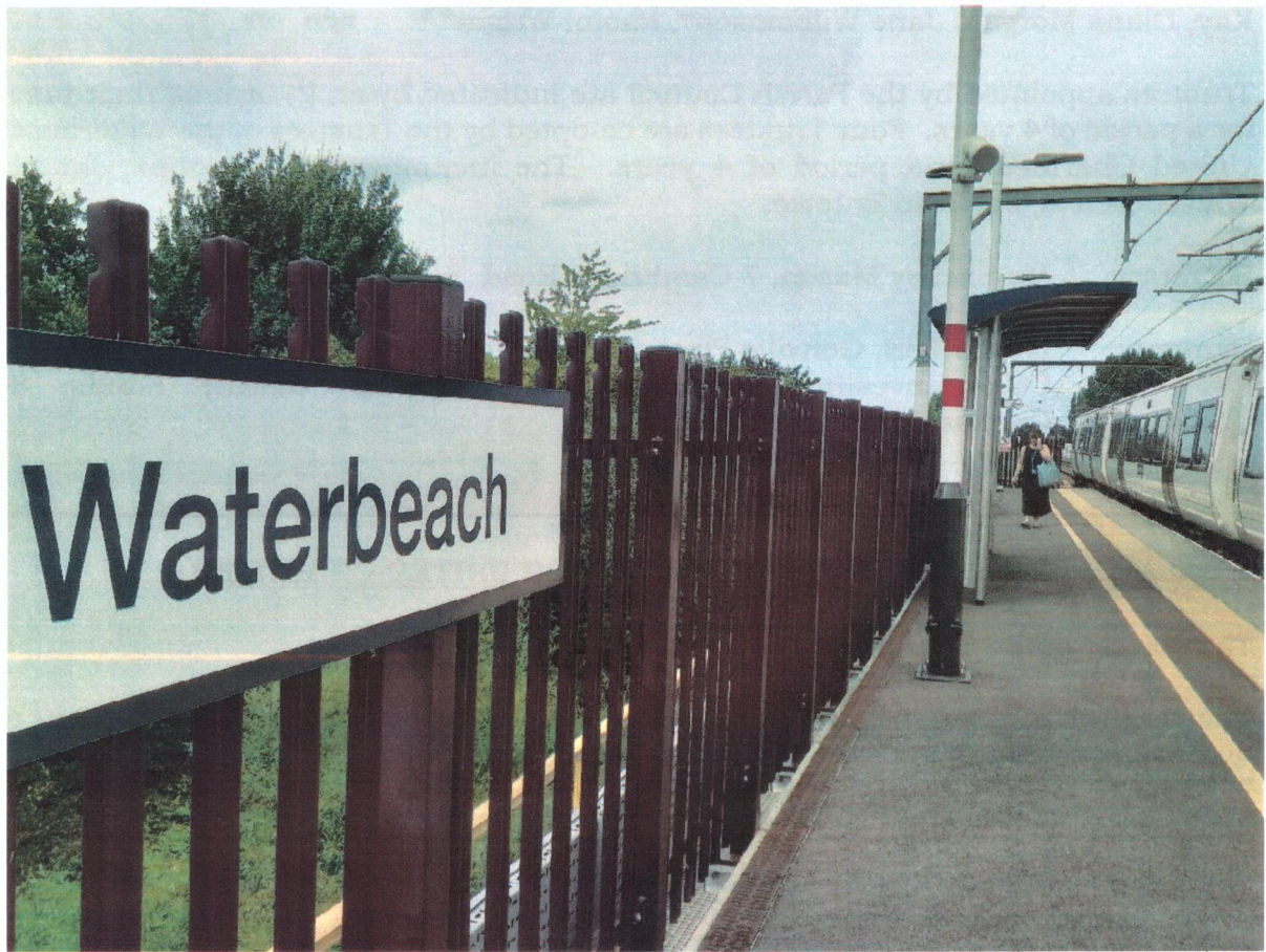
Waterbeach Train Station 2021