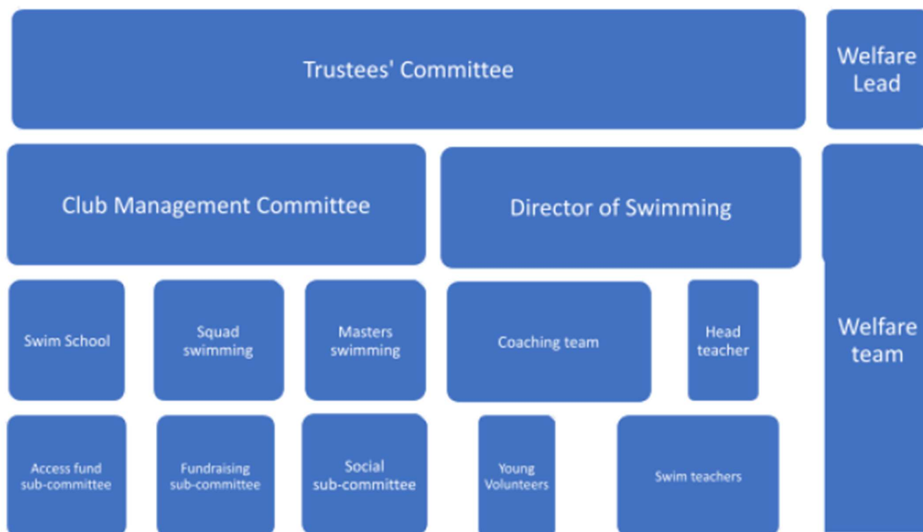
Figure 1 sets out this management structure:

Our Director of Swimming (DoS) manages all our staff and reports into our co-Chairs. The DoS also attends Club Management Committee meetings and ensures appropriate representation of staff at each of the management groups. Day to day operations are run by the DoS or delegated to Head Teacher or other senior coaches. Plans for squad structure, significant changes to operations and our competition calendar are presented to the Club Management Committee or Trustees for decision making.