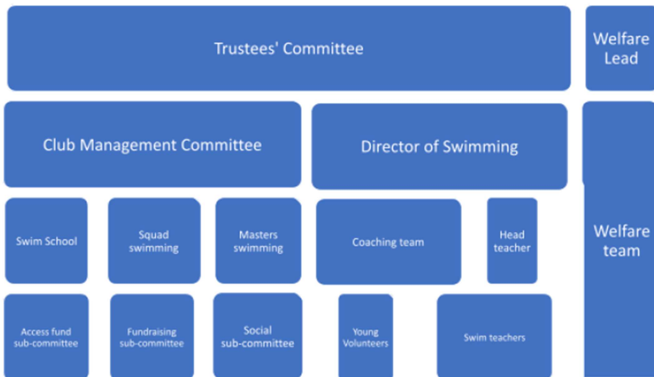
Figure 1 sets out this management structure:

Our Director of Swimming (DoS) manages all our staff and reports into our co-Chairs. The DoS also attends Club Management Committee meetings and ensures appropriate representation of staff at each of the management groups. Day to day operations are run by the DoS or delegated to Head Teacher or other senior coaches. Plans for squad structure, significant changes to operations and our competition calendar are presented to the Club Management Committee or Trustees for decision making.