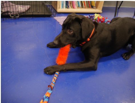
Che – in training at HMP Fosseway

Both puppies are making excellent progress and, upon completion of their 18-month training journey, are destined to become assistance dogs for Bravehound, a charity supporting Armed Forces veterans in Scotland.