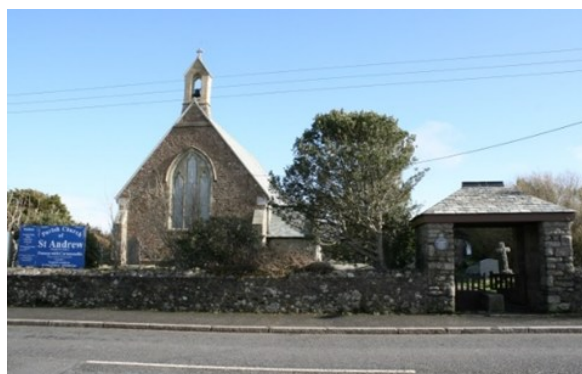
ST ANDREW PENCOYS