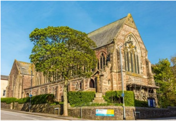
ST ANDREW REDRUTH