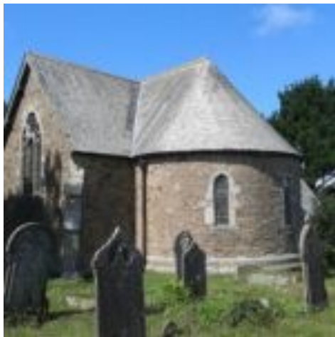
ST STEPHEN, TRELEIGH