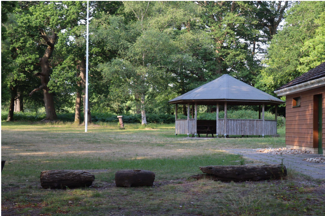
Our Scout Camp Site