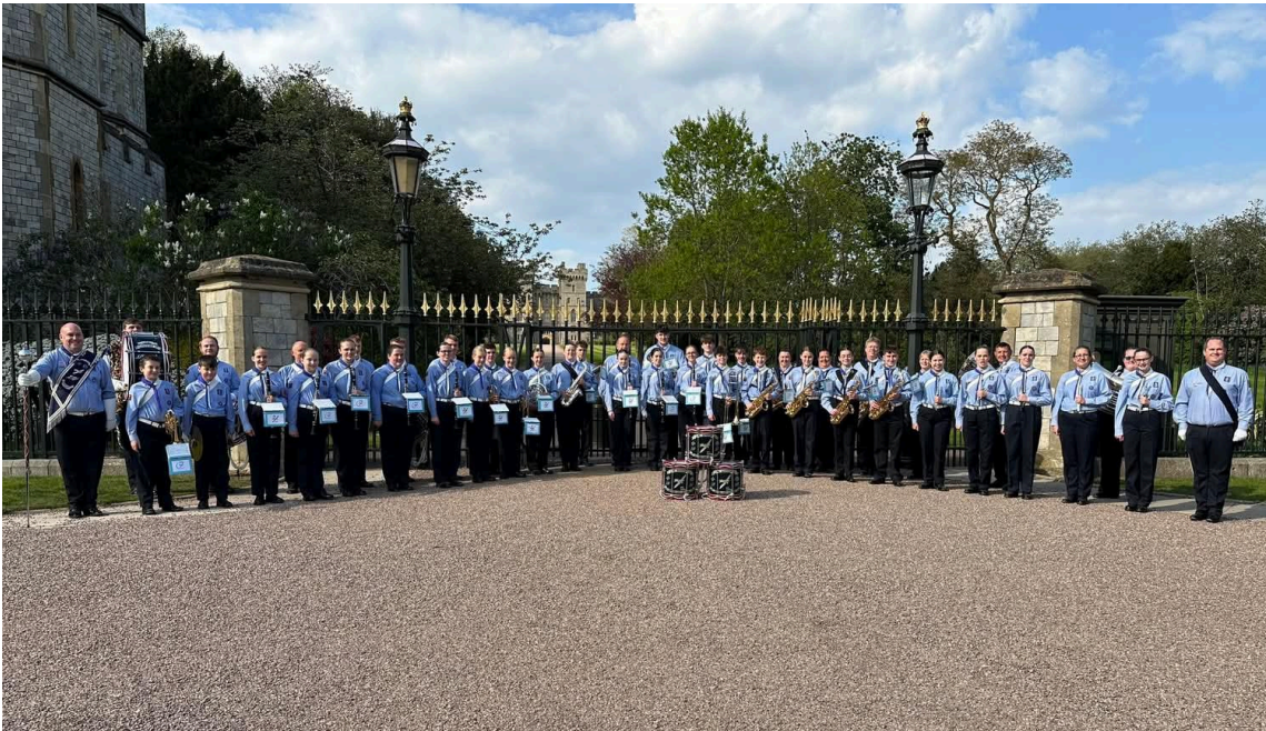
The 14th Eastleigh Scout and Guide Band