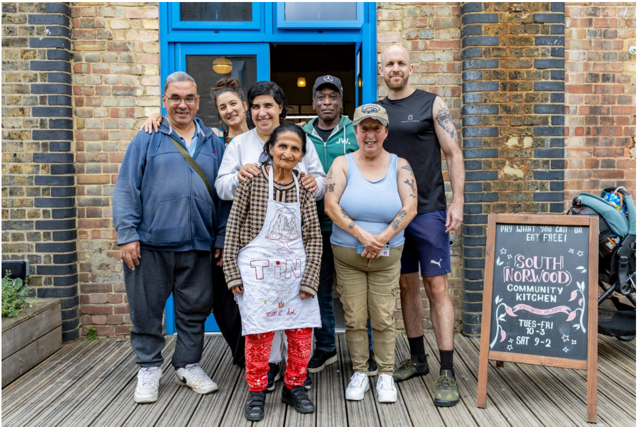
South Norwood Community Kitchen gathers some of their members in the back garden.

With backing from the Civic Power Fund, the Common Good Foundation in Grimsby built a flourishing community organising coalition. In October, this coalition launched a new community group: Local Organising in Grimsby, Immington and Cleethorpes (LOGIC), who held their first assembly that same month. Made up of people and institutions from across the local area and rooted in the football club, they have been campaigning for good local jobs and improved housing conditions. They've built relationships with the local council and the new Mayor. Their focus now is on strengthening the organisation as a key pillar of civic power across the local area.