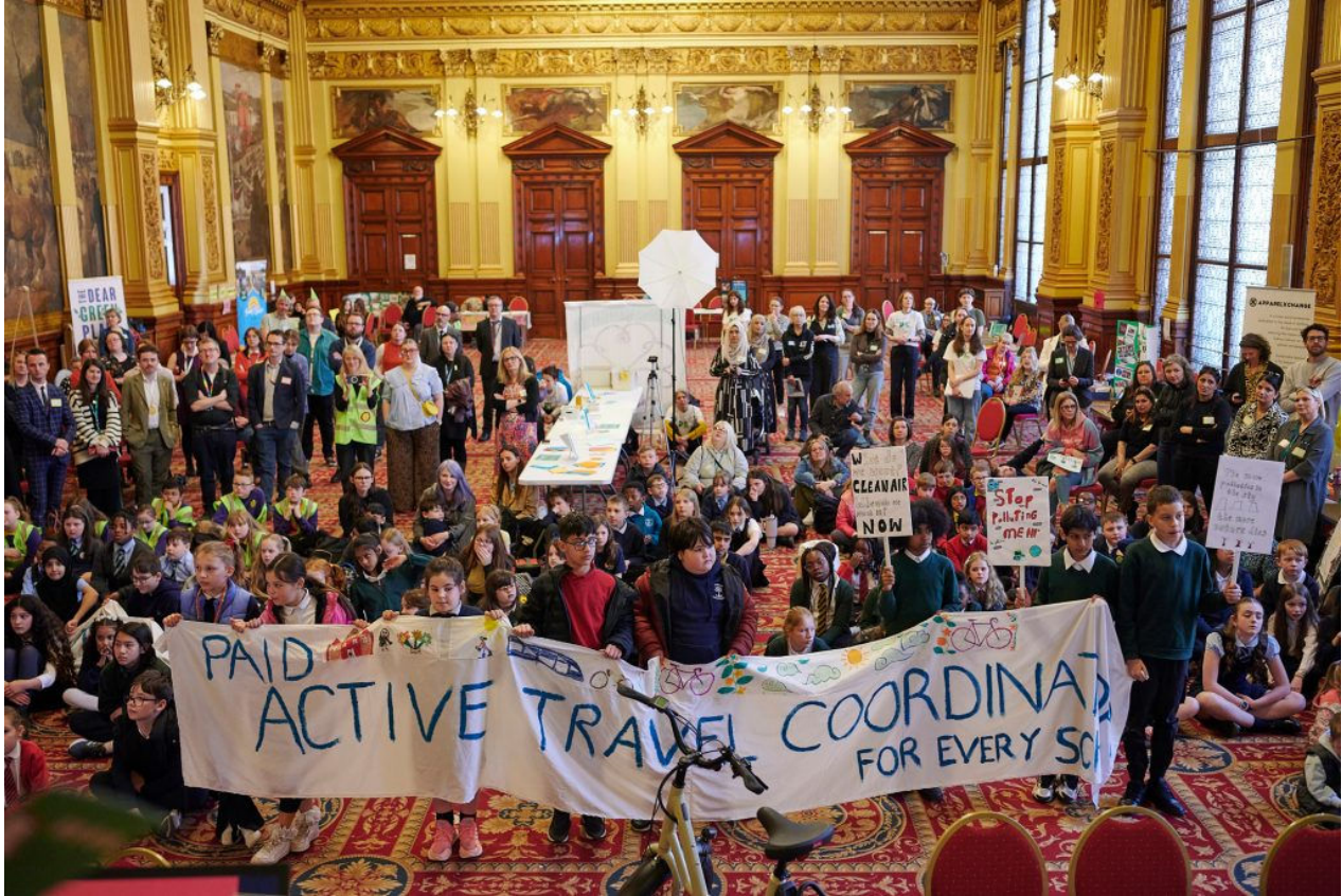
Parents for Future Scotland Glasgow City Chambers Event 2024.

“CPF is an exciting, innovative and much needed addition to the social justice sector. It is strongly values-led and has set out to build long-term capacity, understanding and infrastructure for organising and movement building, so community power is adequately resourced and can thrive. It is committed to shift power from traditional power holders towards the grassroots and is doing this in a thoughtful, participatory and trust-based manner.” 3