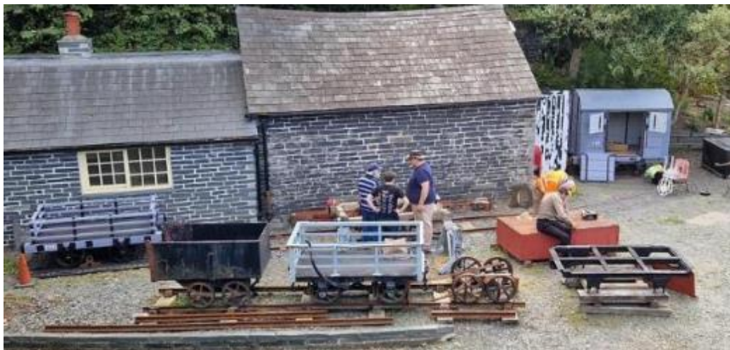
An outside working party in action

The Museum would not survive without its working parties, generally with 4 or 5 regular volunteers, that continued to meet on Thursdays throughout the year. Their work falls into two categories – care and maintenance of the Museum’s fittings and displays, and conservation of the Trust’s historic wagon fleet, on public display at Tywyn Wharf station and occasionally used for special train workings on the Talyllyn Railway. Much of this work has to be done outside and therefore depends on the vagaries of the Welsh weather.