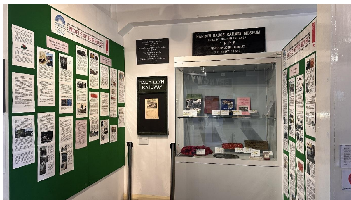
“People of this House” temporary exhibition

The Museum continued its Temporary Exhibition programme, providing an insight into subjects of topical interest and refreshing the Museum experience for repeat visitors. One Exhibition was staged in 2024, “People of this House”, telling the stories of some of the people associated with the Museum’s exhibits, including the designers and builders of locomotives, the people who gave their names to engines, the officers of railways whose name appears on signs and posters, and the quarry owners and those who worked for them. It also celebrated some of the railway preservation pioneers on the Talyllyn Railway.