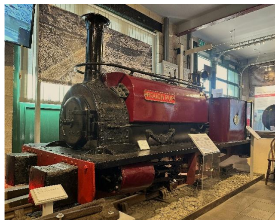
Two of the Museum’s star exhibits – “Dot” and “Rough Pep”

The Trust’s aim is to record and interpret the history of narrow-gauge railways in the British Isles and beyond. While a number of passenger-carrying railways have been preserved and still operate, primarily now to serve the tourist market, many other passenger-carrying lines, as well as numerous industrial and military ones, ceased to exist in the mid-20 th century. The pioneering enthusiasts and collectors of those times laid the basis of the collection while it was still possible, so that today the story of these railways can be told, most of which never achieved the widespread following enjoyed by the main lines, but were in their own way important contributors to economic and social history.