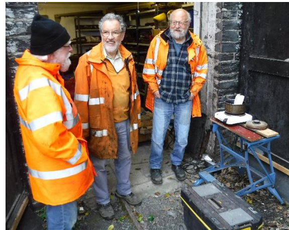
Indoor and outdoor working parties- smiling faces show the benefit of volunteering

Highlights of wagon work during year included: