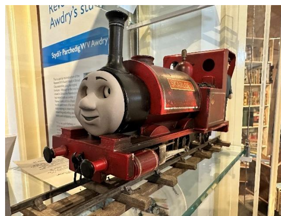
Two contrasting exhibits – Padarn Railway wagons (4ft gauge 'host wagon' conveying 1ft 10¾in slate wagons and guard's van), and model of the Awdry locomotive "Skarloey" derived from Talyllyn Railway No 1 "Talyllyn"