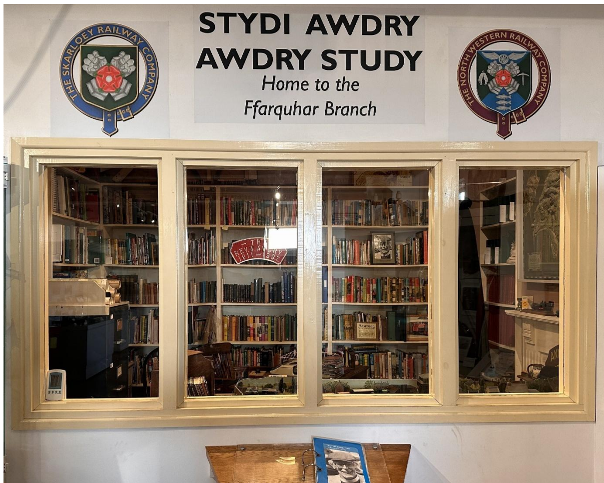
The recreation of Wilbert Awdry’s study, centrepiece of the Museum’s Awdry Collection

The Museum contributed to three special events on the Talyllyn Railway: the “Anything Goes” gala and the highly popular “Awdry Extravaganza” both in July, the latter featuring the railway characters created by the Rev Wilbert Awdry, and a “Heritage Weekend” in September, a recent innovation but rapidly becoming a fixture in the Railway’s calendar.