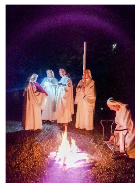
New fire of Easter

The sisters acknowledge that not everyone feels confident or comfortable using Facebook or YouTube and have accommodated this by sending PowerPoint presentations by email, or hardcopies by post, on request.