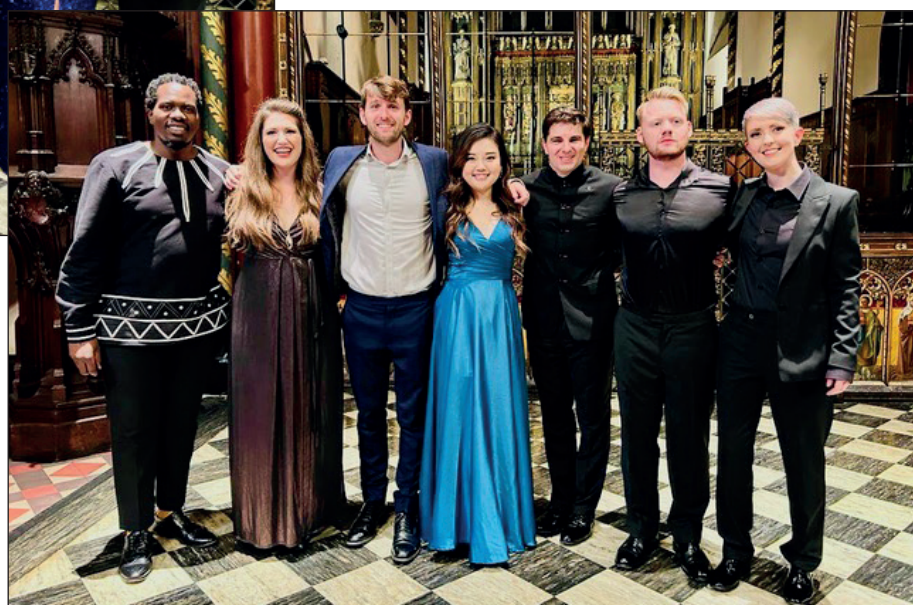
Some of the performers at the first concerts sponsored by Brunswick Vocal Arts

The charity has established a firm online presence and steadily growing following through its social media channels and simple, user-friendly, well-designed website.