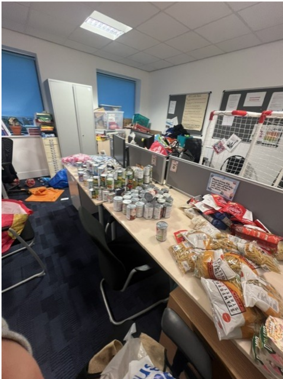
A selection of the hundreds of items we collect each year for the 'Goody Bags'.

But thanks to the generosity of local businesses we are able to provide a Christmas Goody Bag. Each Christmas session every child attending receives a Goody Bag, containing foodstuffs, sweets, fruit and vegetables and items of clothing such as gloves.