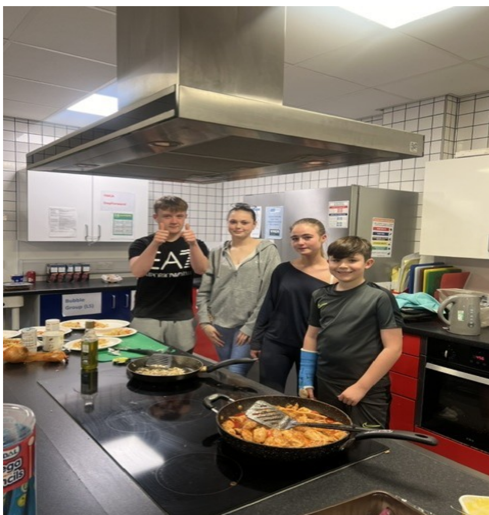
Young Leaders in the Award-winning Kitchen

However, each year the cost of running MYTI increase.