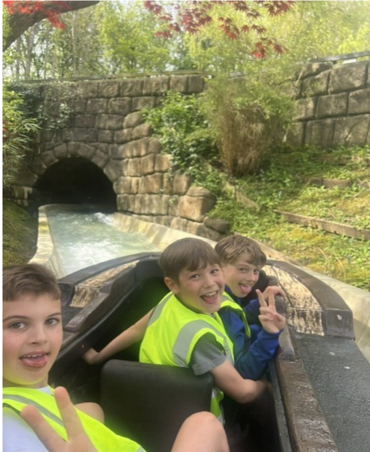
Raging Rapids at Thorpe Park

It's fair to point out that these trips are not cheap - to take a group of children to Thorpe Park, in Surrey, can cost over £1300, depending on us being able to 'negotiate' a discount on the coach and the entry fee!