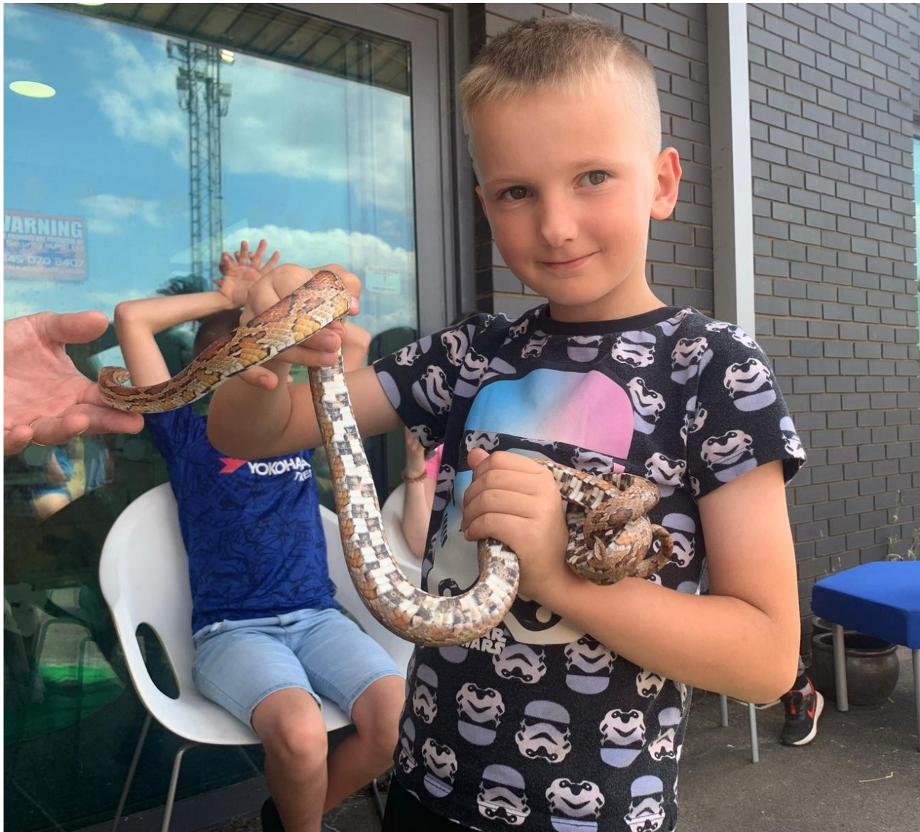
A unique and memorable experience for one of our children