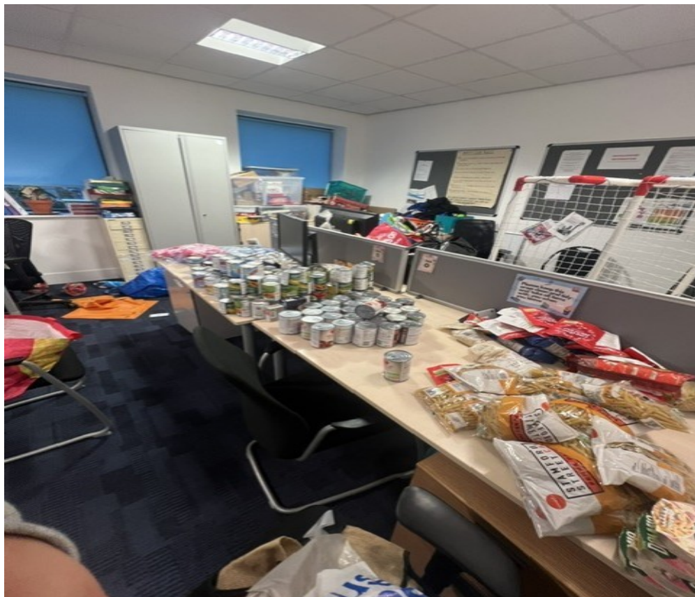
A selection of the hundreds of items we collect each year for the 'Goody Bags'.

Each Christmas session every child attending receives a Goody Bag, containing foodstuffs, sweets, fruit and vegetables and useful items of clothing such as gloves.