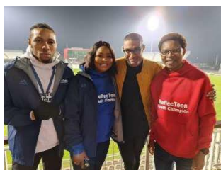
ReflecTeen on BBC One Show

ReflecTeen is profoundly appreciative to its funders and partners: