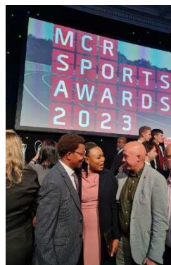
ReflecTeen at Sport Award 2023