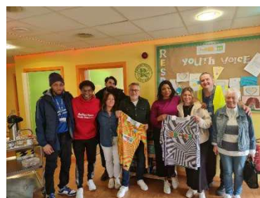
Funders Visit at ReflecTeen Hub