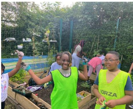
Nature active gardening

The demand for assistance with the rising living crisis, delivering the Cost-of-Living Crisis project means that we have steadily increased provision of wraparound services, providing practical support and hot healthy refreshments and food during our provisions. We constantly require donations of hygiene products and food would like to thank the Hygiene Bank and Funding from the MCC CHEM that enabled us to provide support directly to families in need particularly during the winter months with the provision of family essential parcel during our annual Christmas party and wellbeing support programmes helped us to build strong relationships with our elderly local demography to improve their quality of life.