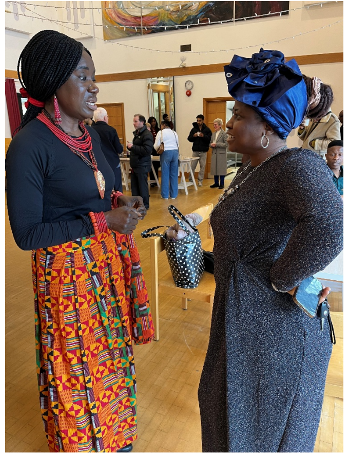
Catching up with friends at coffee after Morning Service