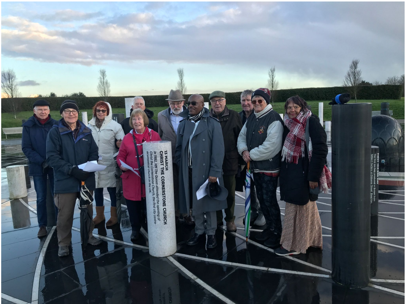
Celebrating The Church of Christ the Cornerstone Day (13 March) at the MK Rose in Campbell Park