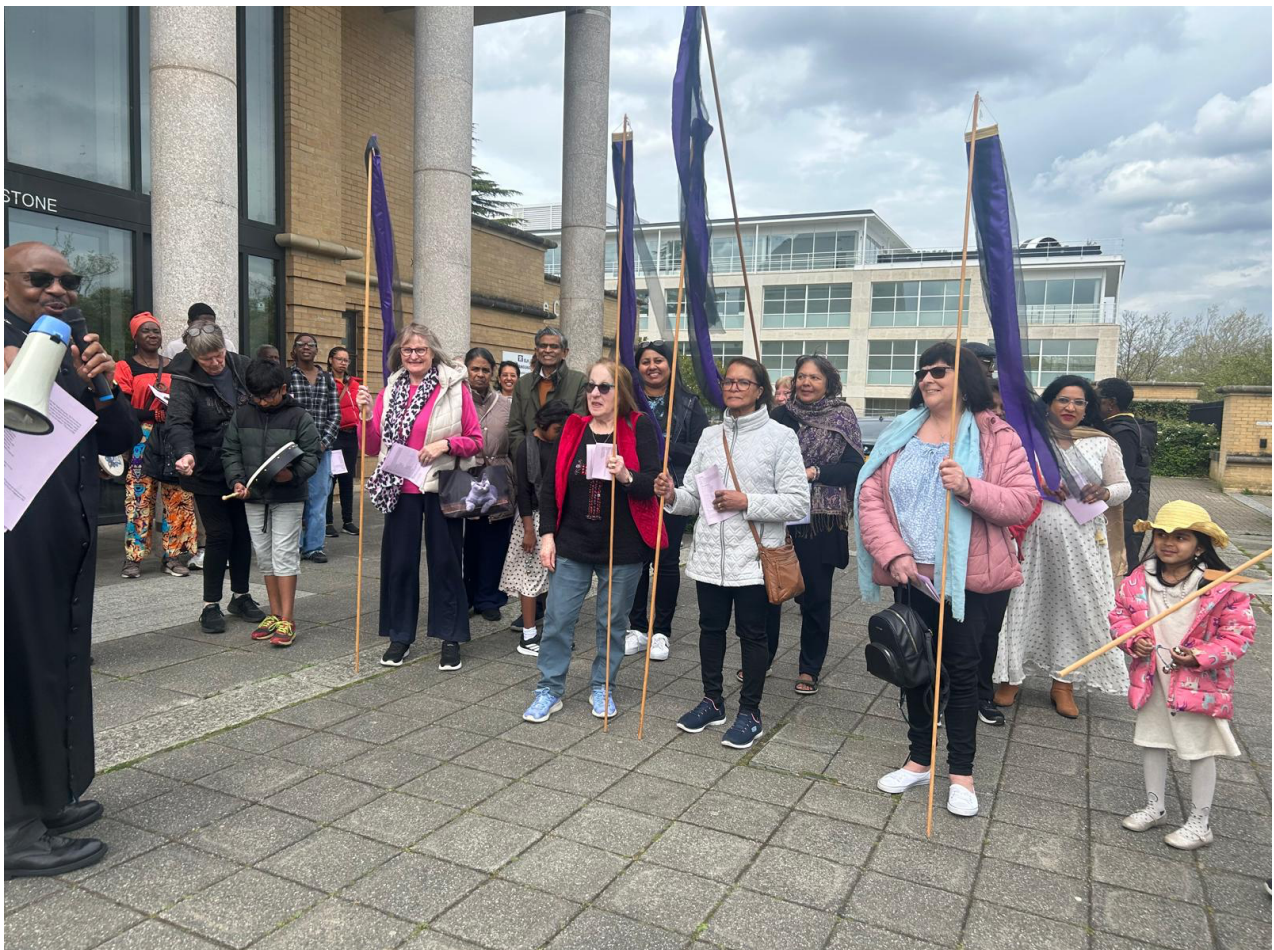
Setting out on Cornerstone's Good Friday Walk of Witness