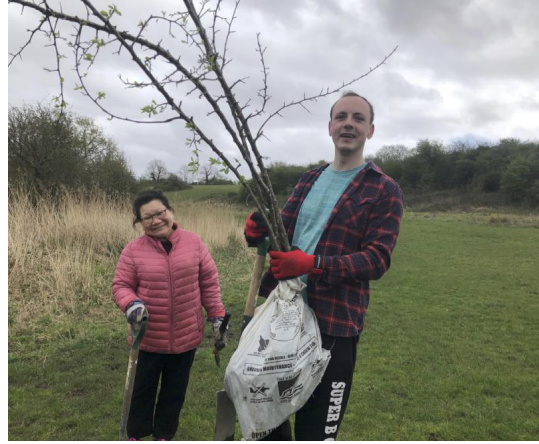
Volunteering at the park in Wales