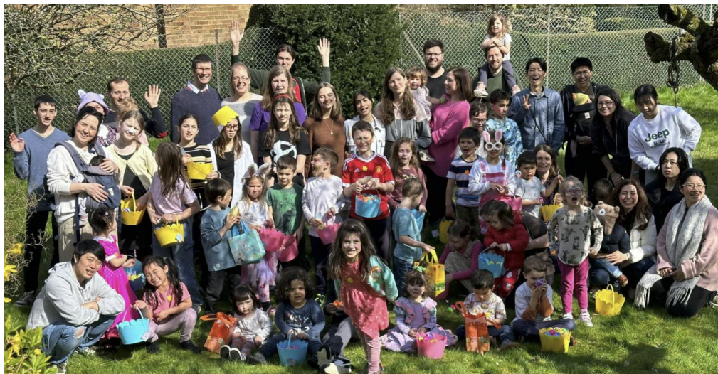
Easter children's ministry fun