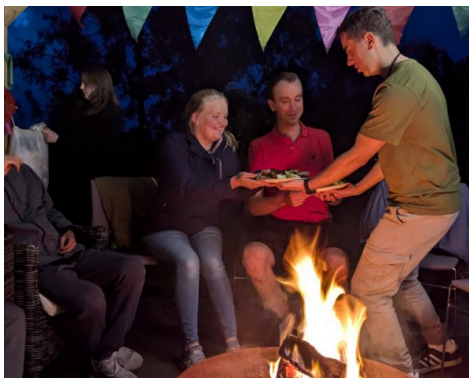
Camping trip by Scotland and North England

Prayer and devotion also formed an important thread throughout the year. In North London, regular Monday morning prayers anchored members in faith, while in Scotland, a new prayer service inspired many through shared testimonies. The Cheonbo Team's workshop brought added depth and healing to the community. In the North of England, the year began with a 40-day prayer condition for peace in the world, uniting members in intercession for an end to global conflicts.