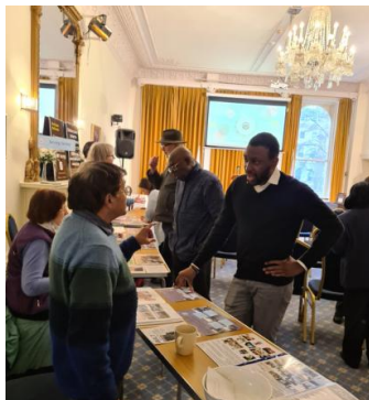
The community connections fair