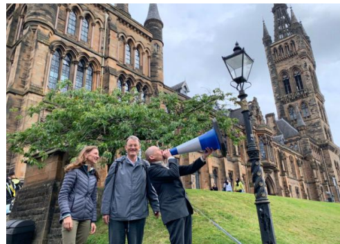
The winning team of Father Moon's Ascension Anniversary activities in Scotland

The annual Community Connections fair in North London once again proved to be a platform for creativity and collaboration, with members presenting new proposals while ongoing projects shared their achievements. Six fresh initiatives were put forward alongside eight ongoing ones, showing the breadth of ideas and the energy within the community to bring them to life.