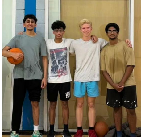
Sports events in North of England sharing the values of brotherhood