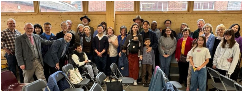
Workshop service in North London

New and existing initiatives gave fresh energy to our communities, with homes and centres transforming into hubs of connection through workshops, youth gatherings, and small groups. These spaces welcomed members and guests of all ages, while young families found support and encouragement through regular meetups. Together, these efforts ensured that worship remained not only a weekly ritual, but a living source of renewal for individuals, families, and the wider community.