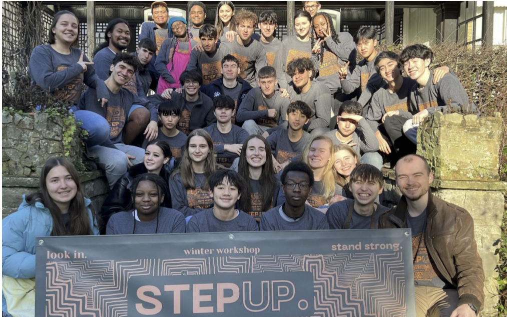
Winter workshop participants