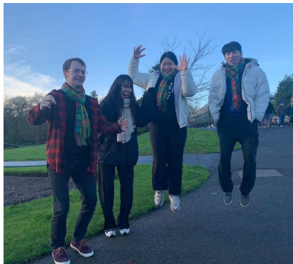
Missionaries team in Glasgow