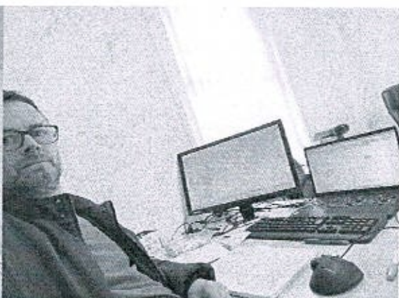
New Heart for Chorley staff office