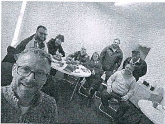
Heart for Chorley Personal Development Session