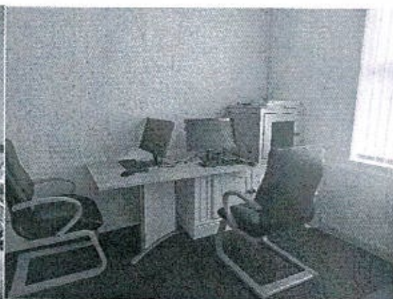
New computers for beneficiary use