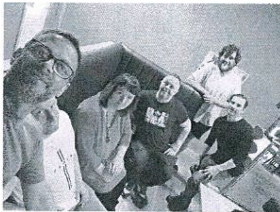
Celebrating Heart for Chorley Resident's 1 st anniversary

The relief of those in need by reason of addiction, criminality, unemployment, financial hardship, homelessness and those at risk of homelessness in Chorley in particular by the provision of recovery and support services and self-help coaching services designed encourage beneficiaries to assess their options, make more effective decisions and take ownership of their actions.